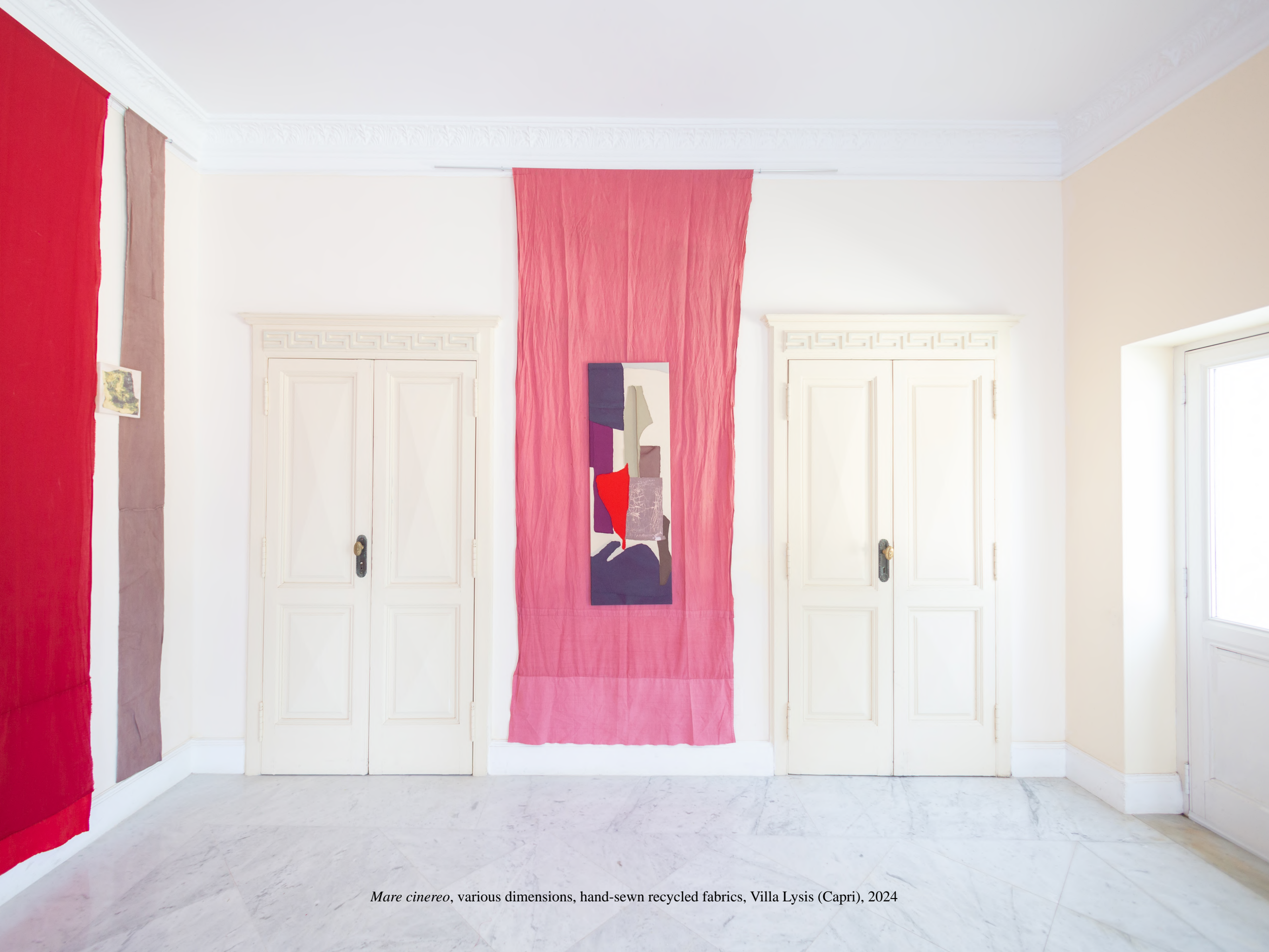
Mare cinereo , various dimensions, hand-sewn recycled fabrics, Villa Lysis (Capri), 2024