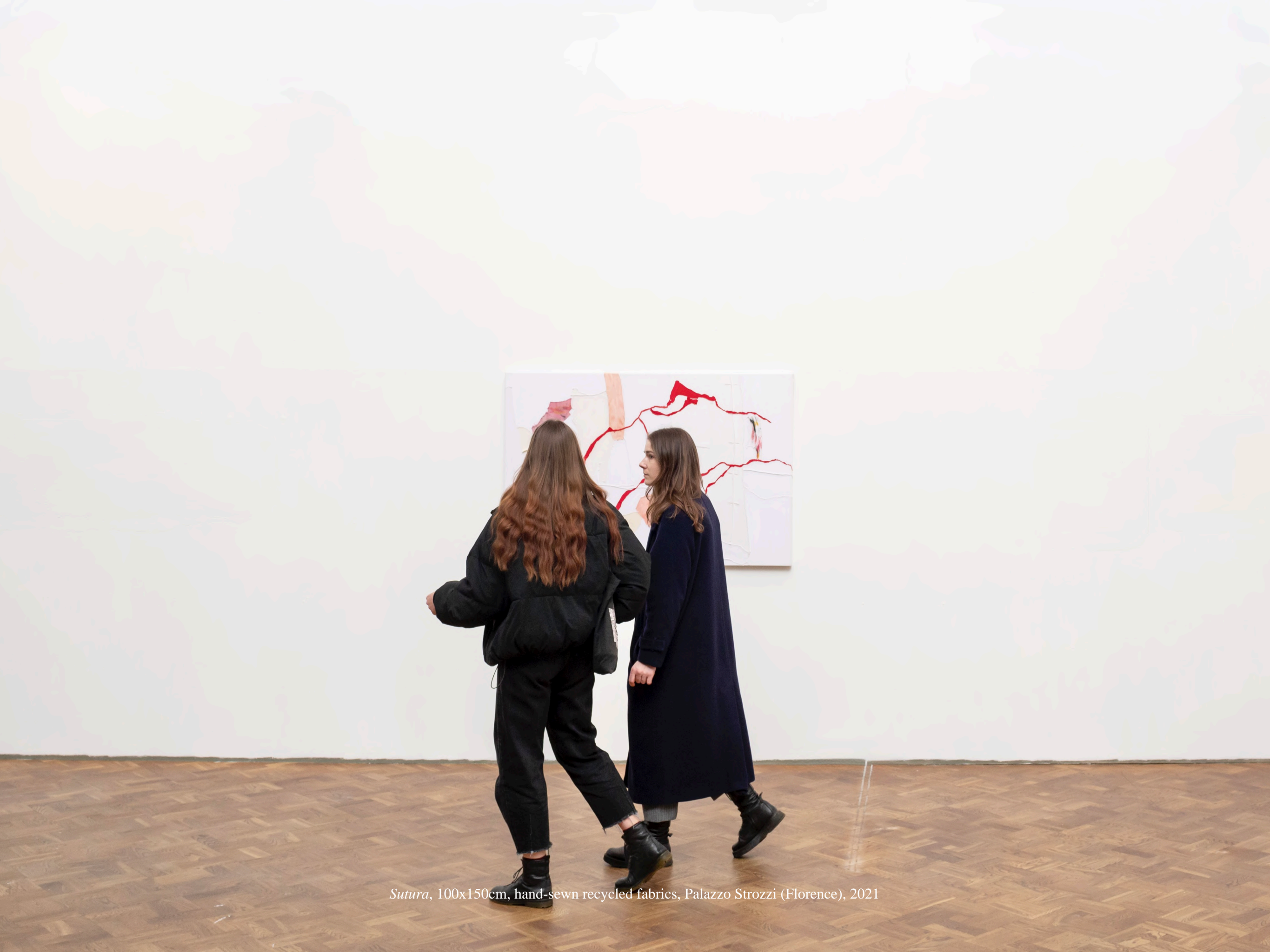
Sutura , 100x150cm, hand-sewn recycled fabrics, Palazzo Strozzi (Florence), 2021