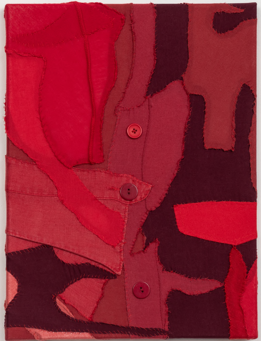
Untitled (Red Monochromes) , 30x40cm, hand-sewn recycled fabrics, Palo Gallery (New York), 2025