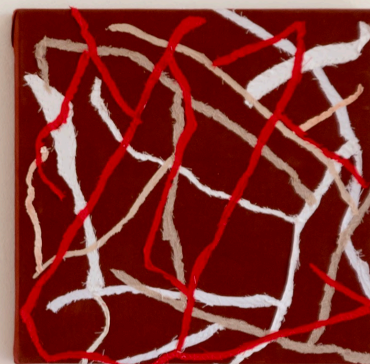
A tutto spessore , 30x30cm, hand-sewn recycled fabrics, Cavalerizza Reale (Turin), 2022