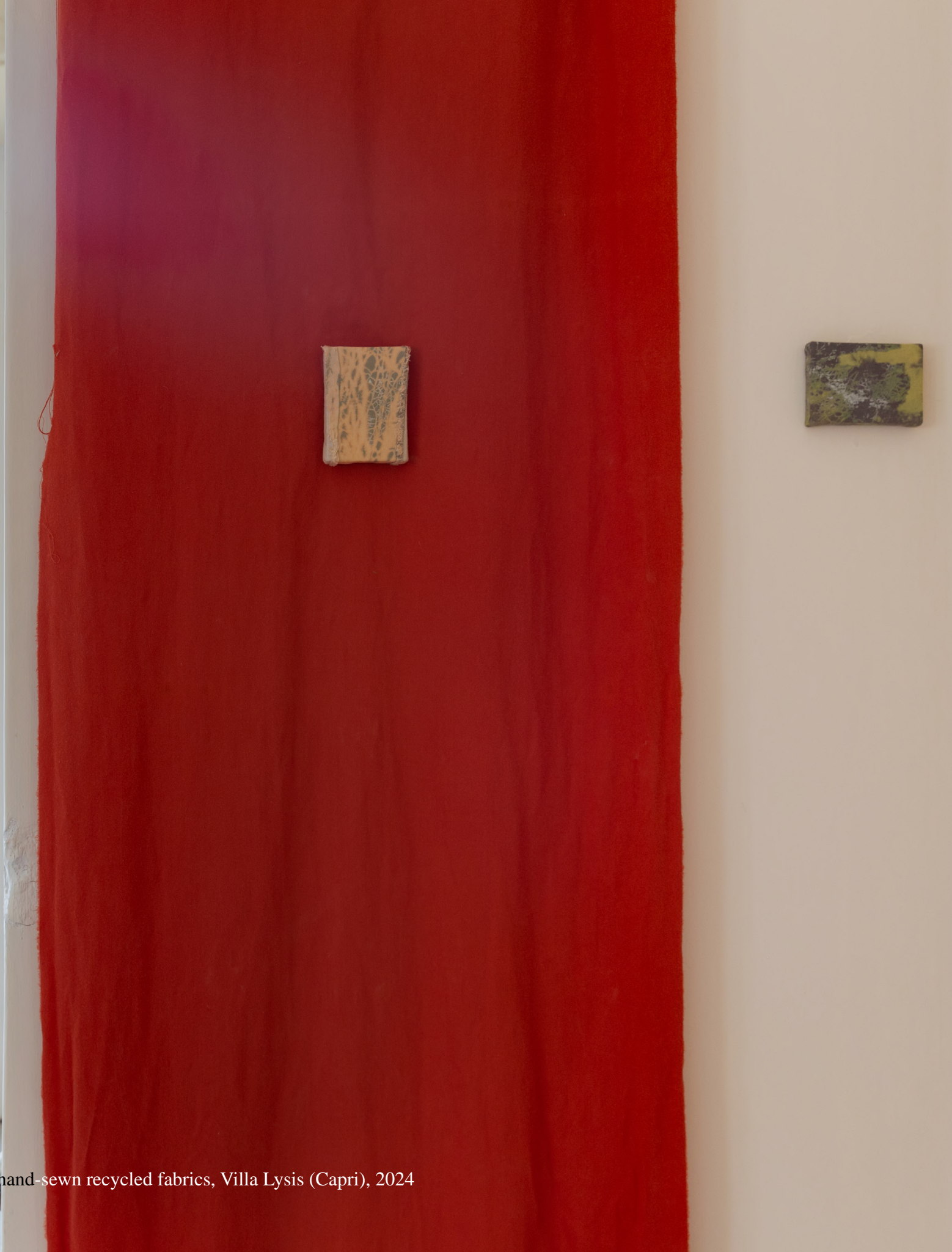
Mare cinereo , 5x8cm, hand-sewn recycled fabrics, Villa Lysis (Capri), 2024