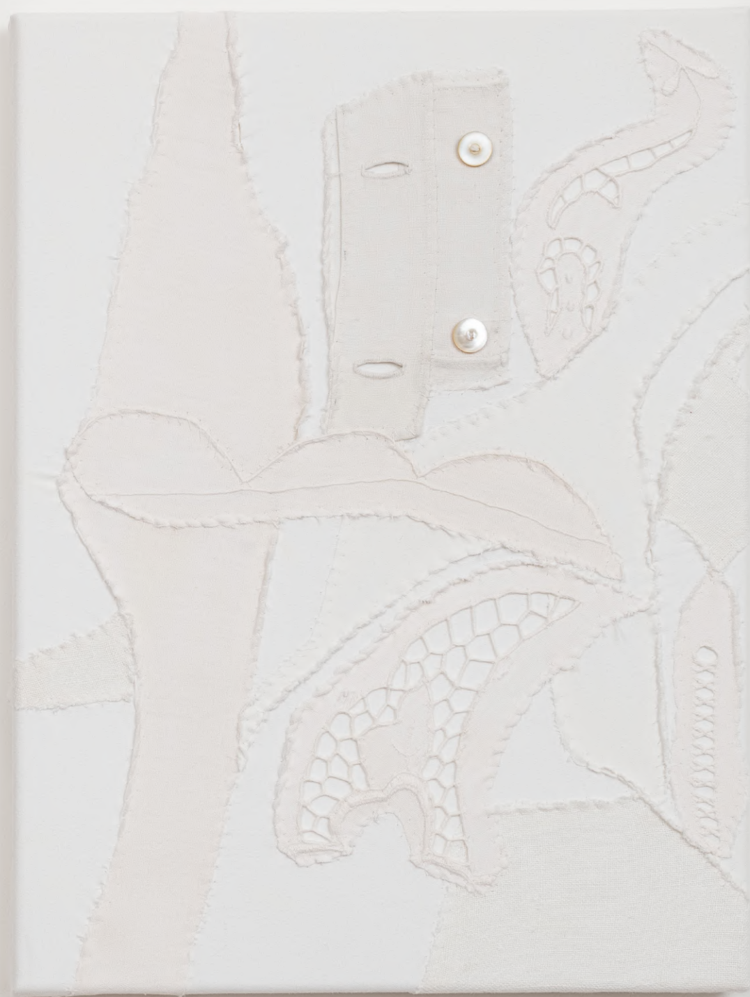
Spolia , 30x40cm, hand-sewn recycled fabrics, Palo Gallery (New York), 2025