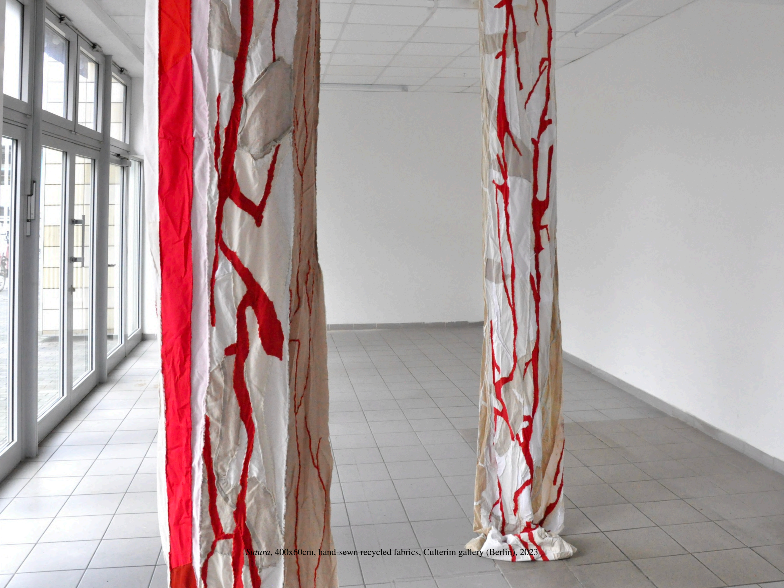
Sutura , 400x60cm, hand-sewn recycled fabrics, Culterim gallery (Berlin), 2023