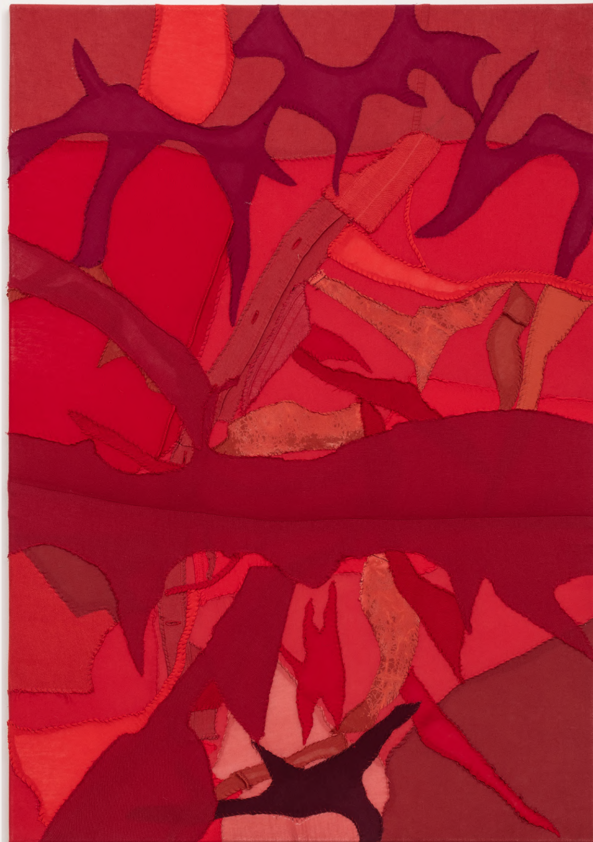
Untitled (Red Monochromes) , 100x70cm, hand-sewn recycled fabrics, Palo Gallery (New York), 2025