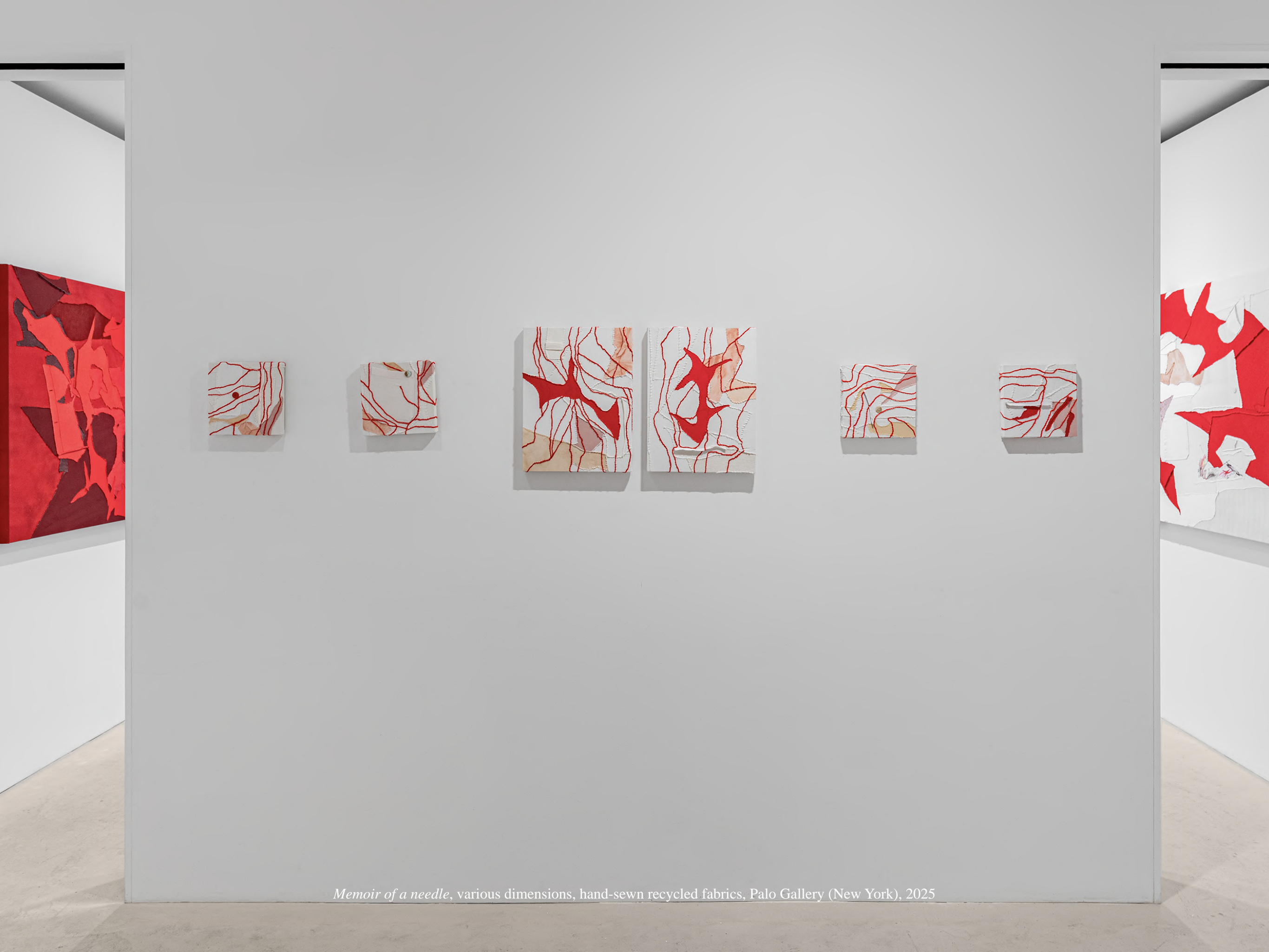
Memoir of a needle , various dimensions, hand-sewn recycled fabrics, Palo Gallery (New York), 2025