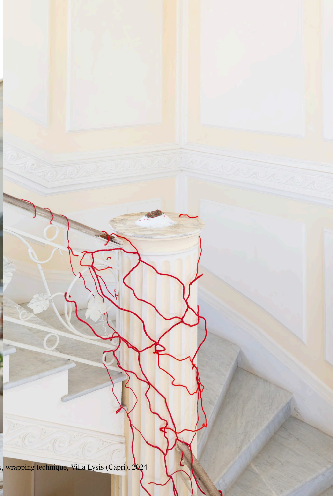
Di mare e il suo orlo , site specific installations, wrapping technique, Villa Lysis (Capri), 2024