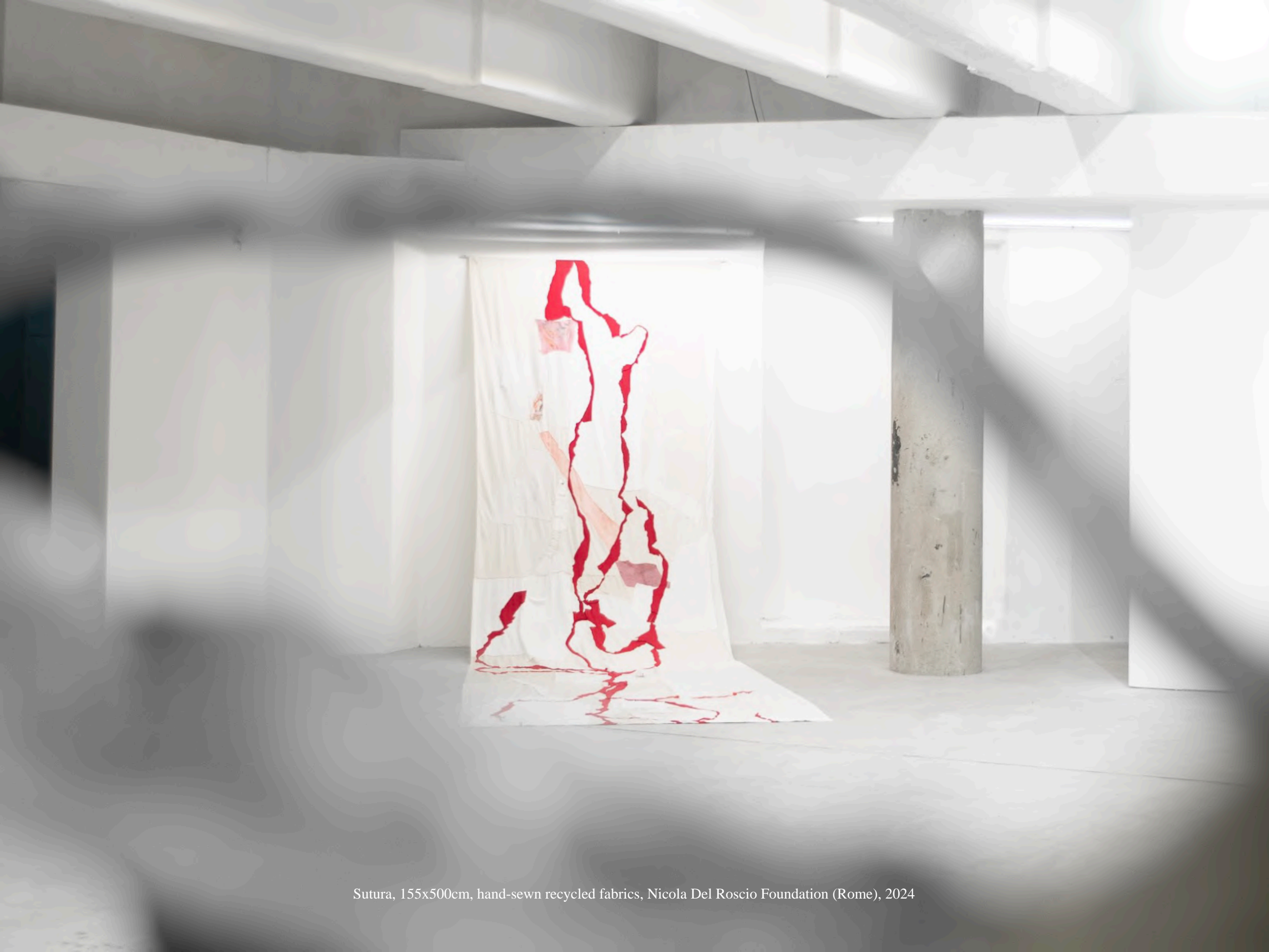
Sutura, 155x500cm, hand-sewn recycled fabrics, Nicola Del Roscio Foundation (Rome), 2024