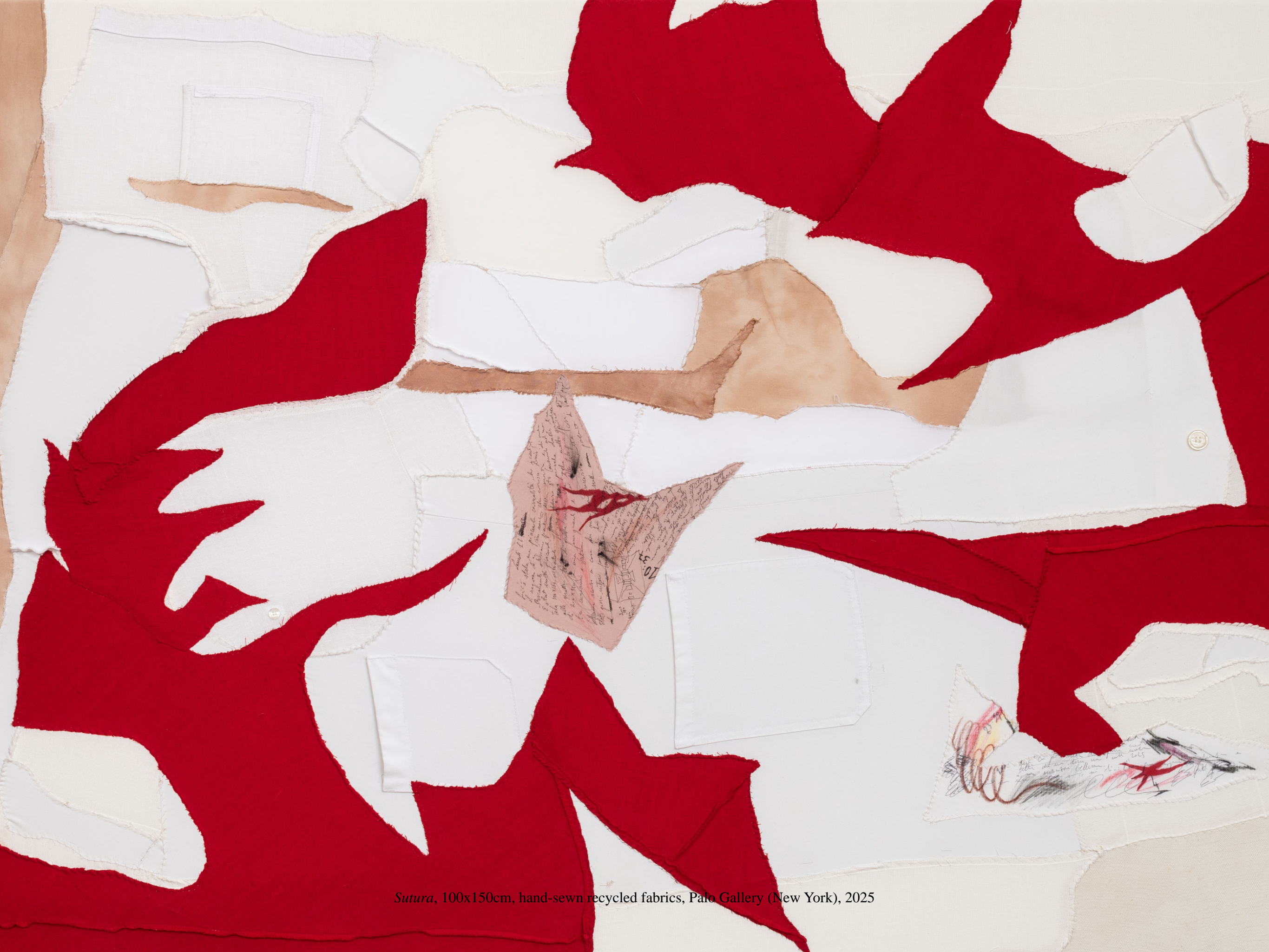
Sutura , 100x150cm, hand-sewn recycled fabrics, Palo Gallery (New York), 2025