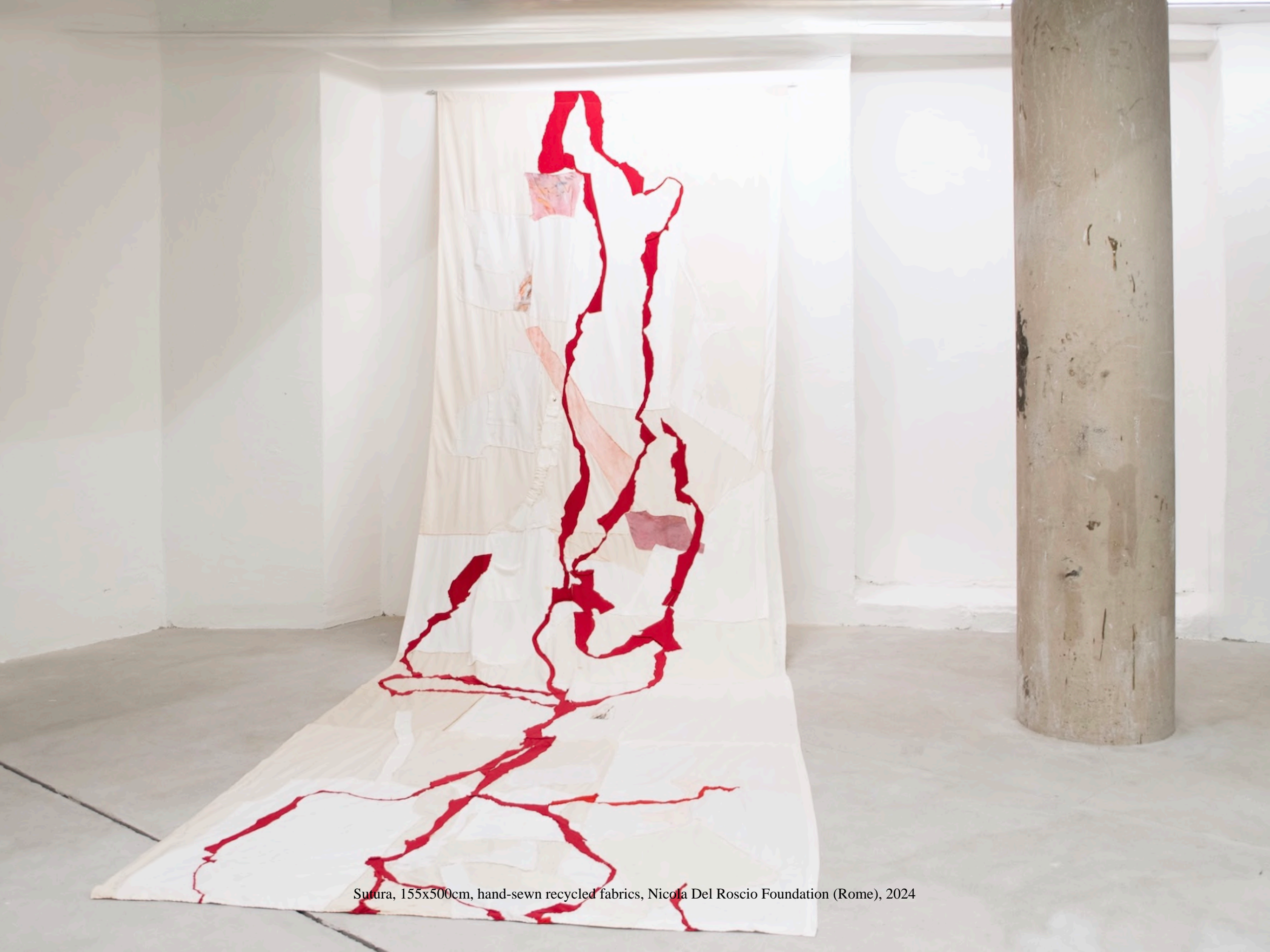
Sutura, 155x500cm, hand-sewn recycled fabrics, Nicola Del Roscio Foundation (Rome), 2024