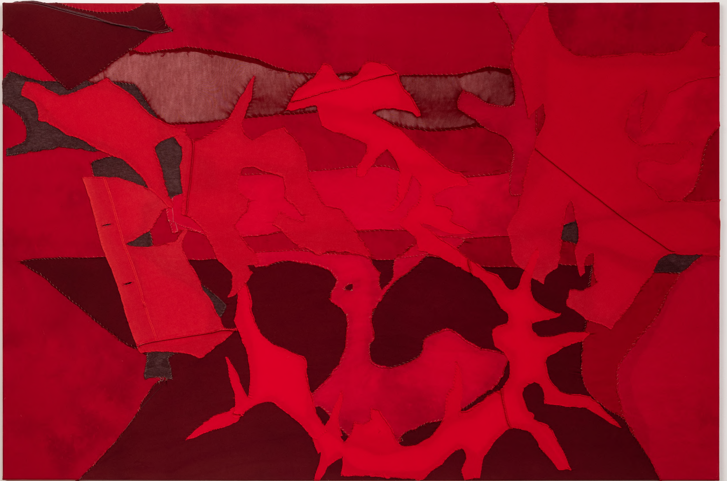
Untitled (Red Monochromes) , 100x150cm, hand-sewn recycled fabrics, Palo Gallery (New York), 2025