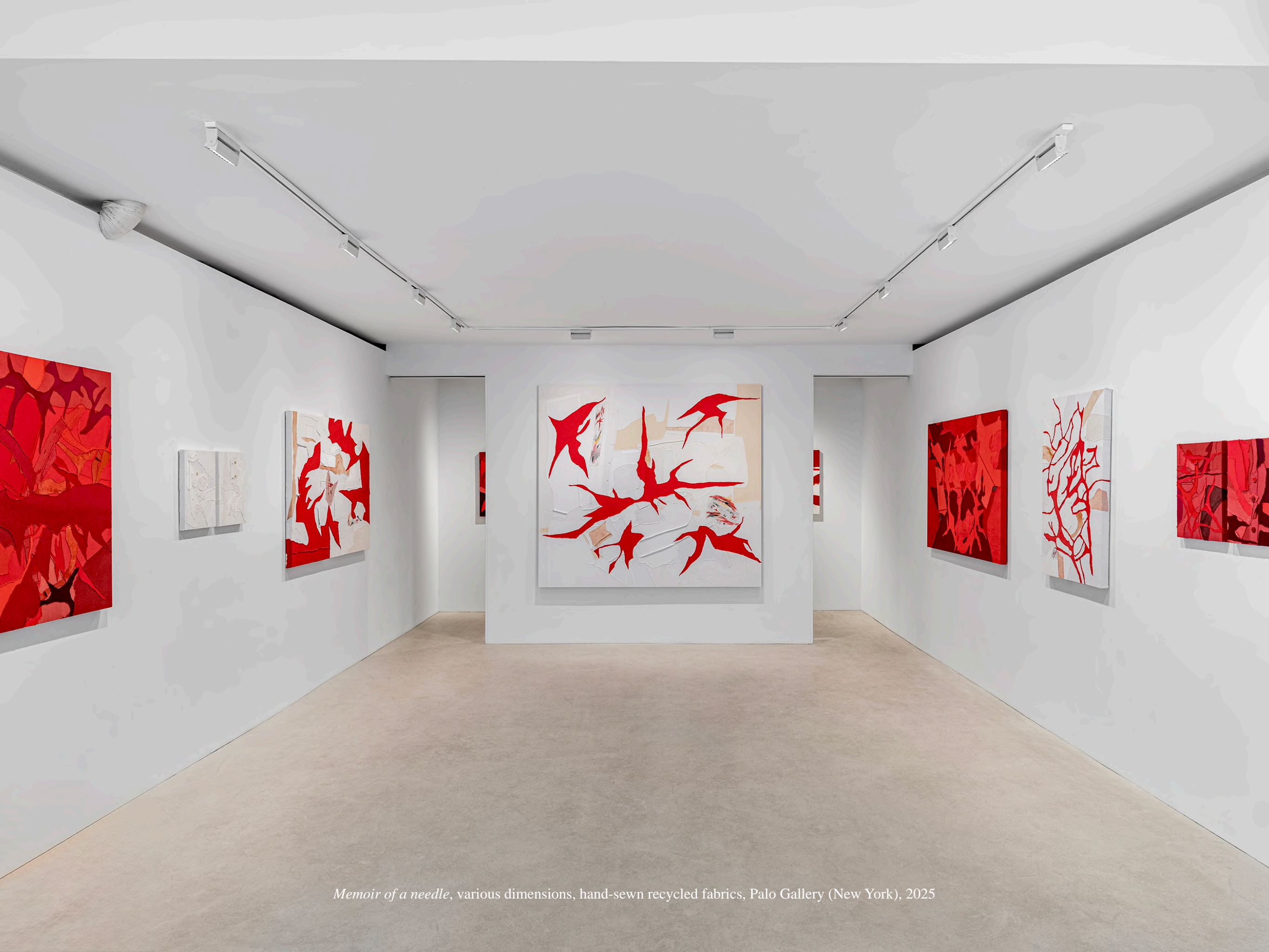
Memoir of a needle , various dimensions, hand-sewn recycled fabrics, Palo Gallery (New York), 2025