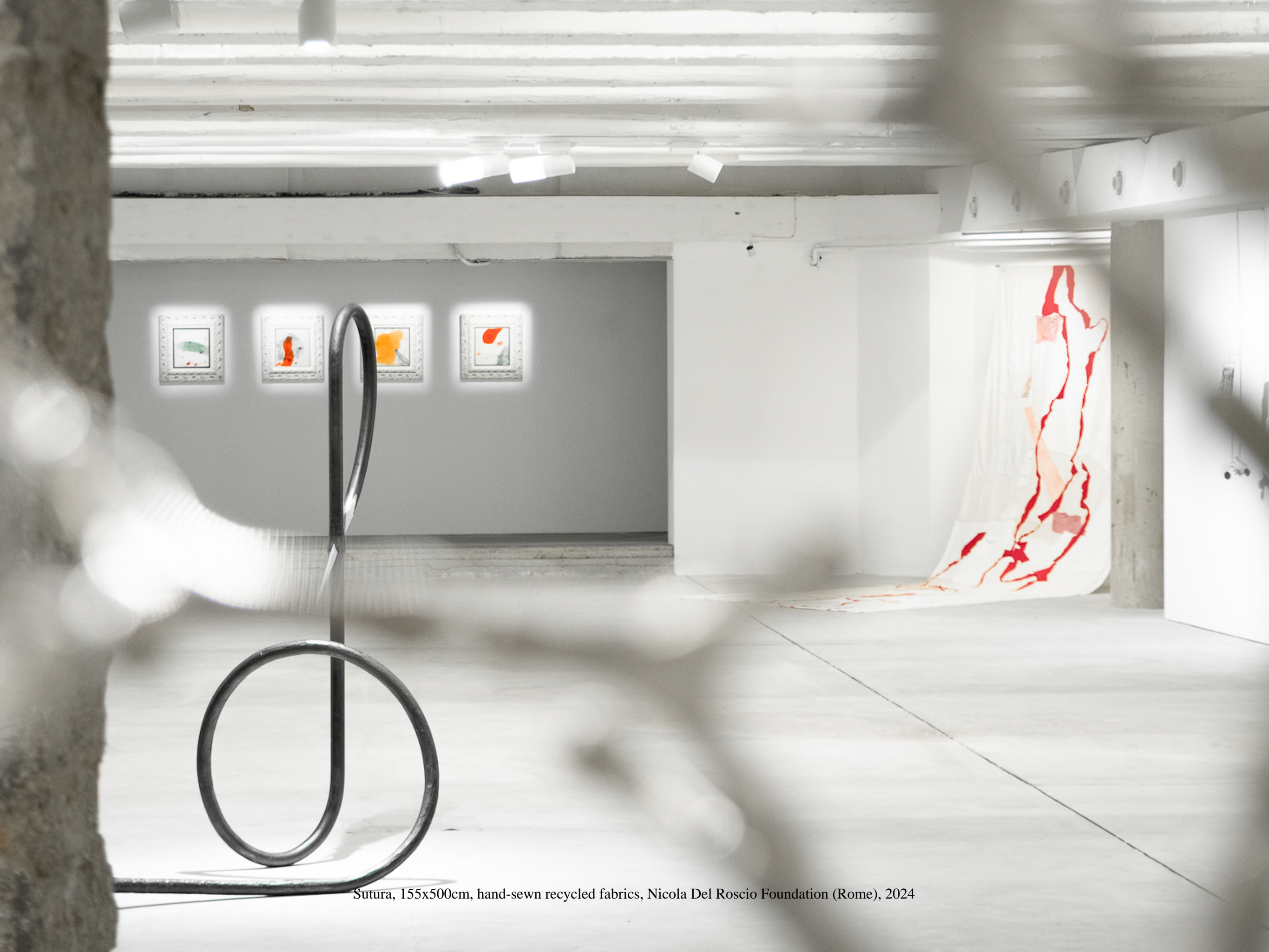
Sutura, 155x500cm, hand-sewn recycled fabrics, Nicola Del Roscio Foundation (Rome), 2024