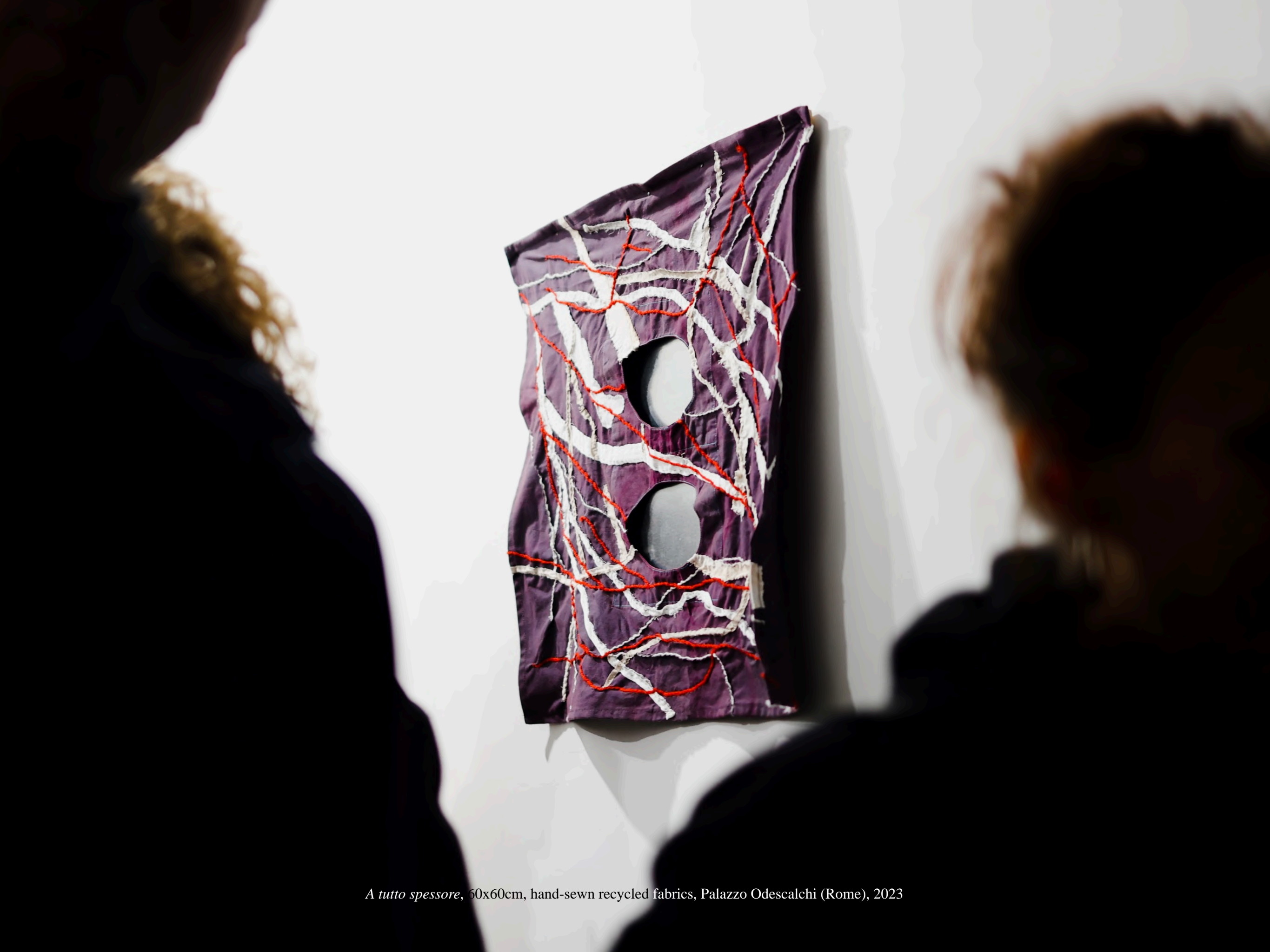
A tutto spessore , 60x60cm, hand-sewn recycled fabrics, Palazzo Odescalchi (Rome), 2023