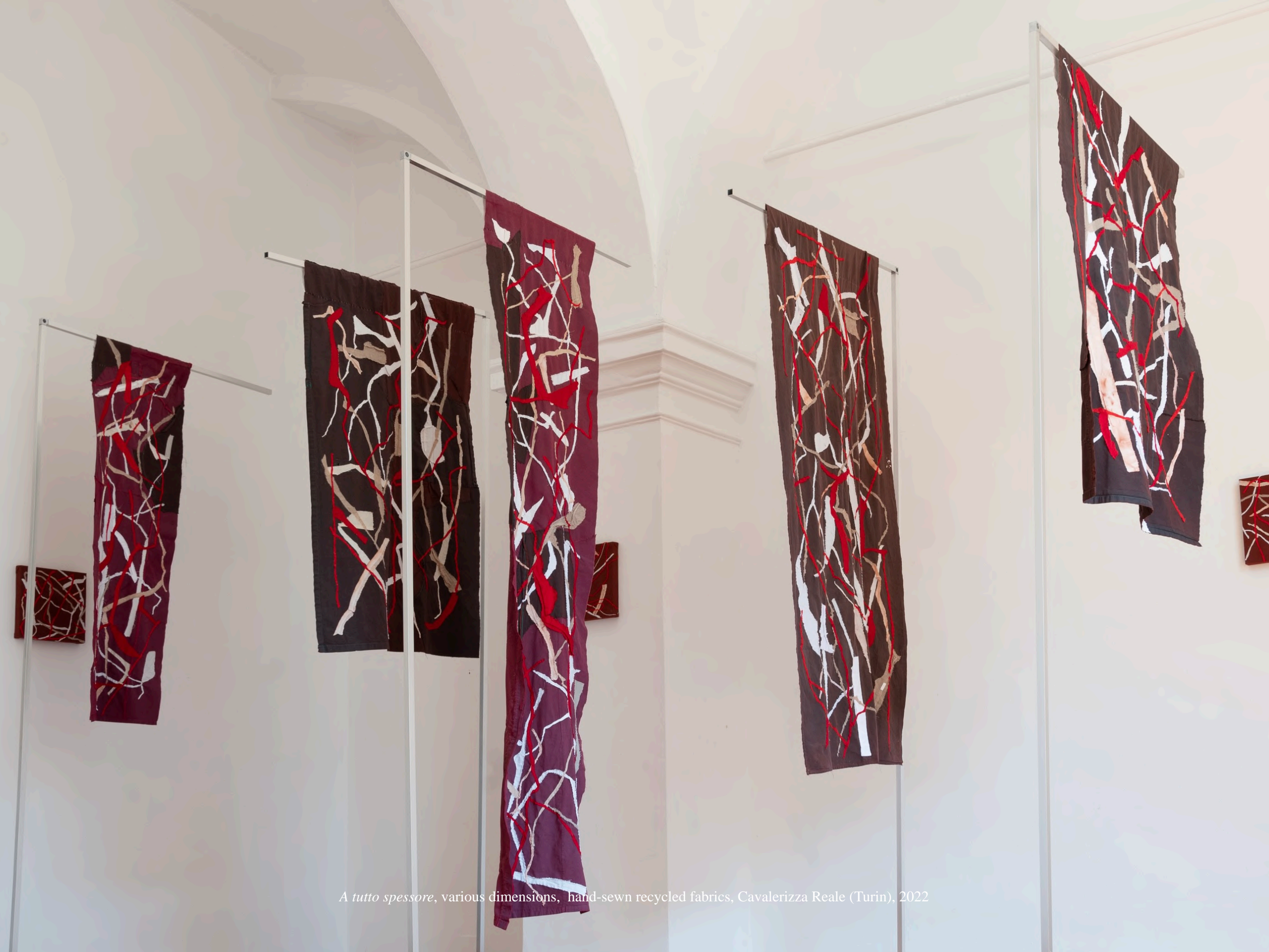
A tutto spessore , various dimensions, hand-sewn recycled fabrics, Cavalerizza Reale (Turin), 2022