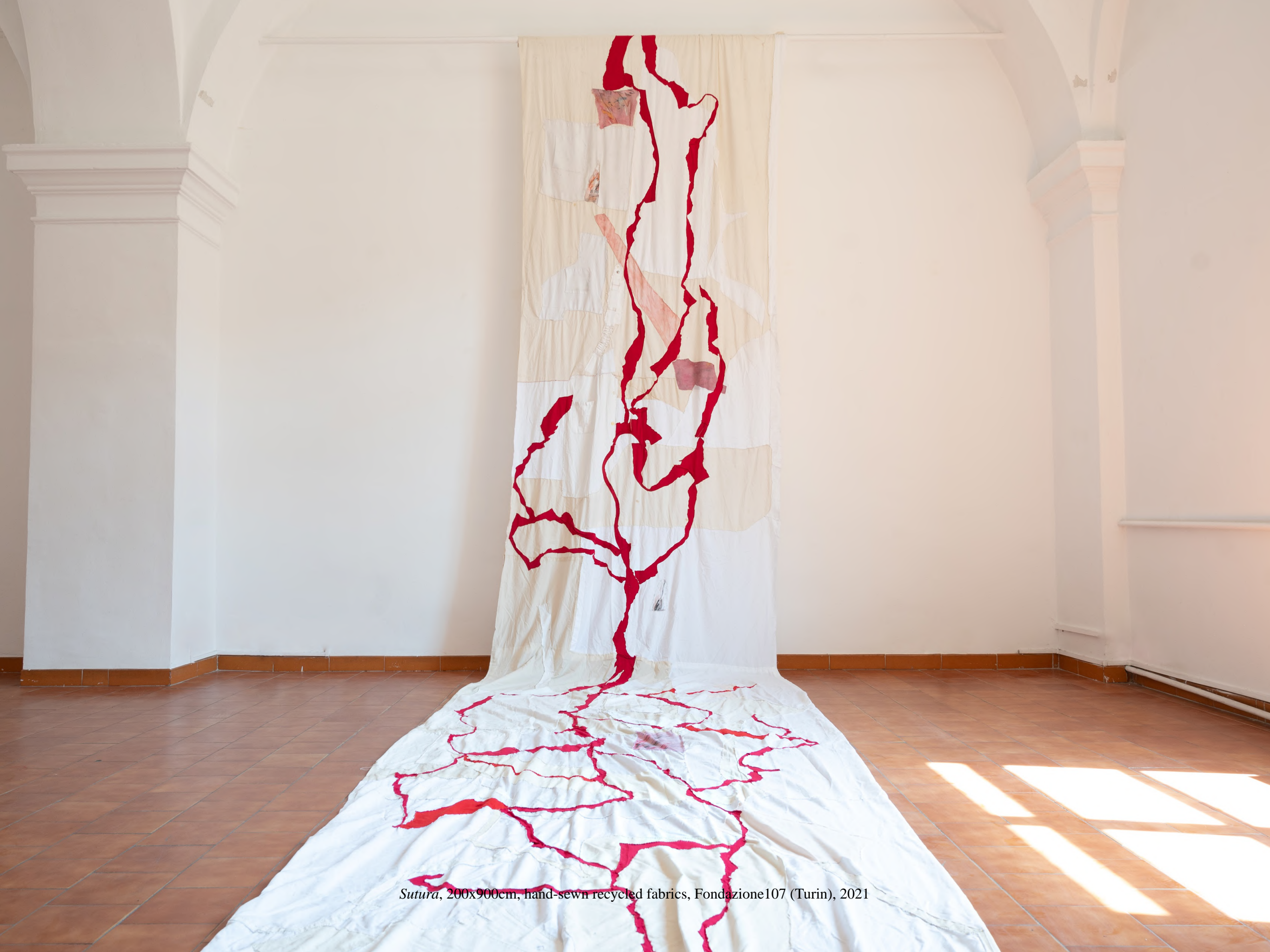
Sutura , 200x900cm, hand-sewn recycled fabrics, Fondazione107 (Turin), 2021