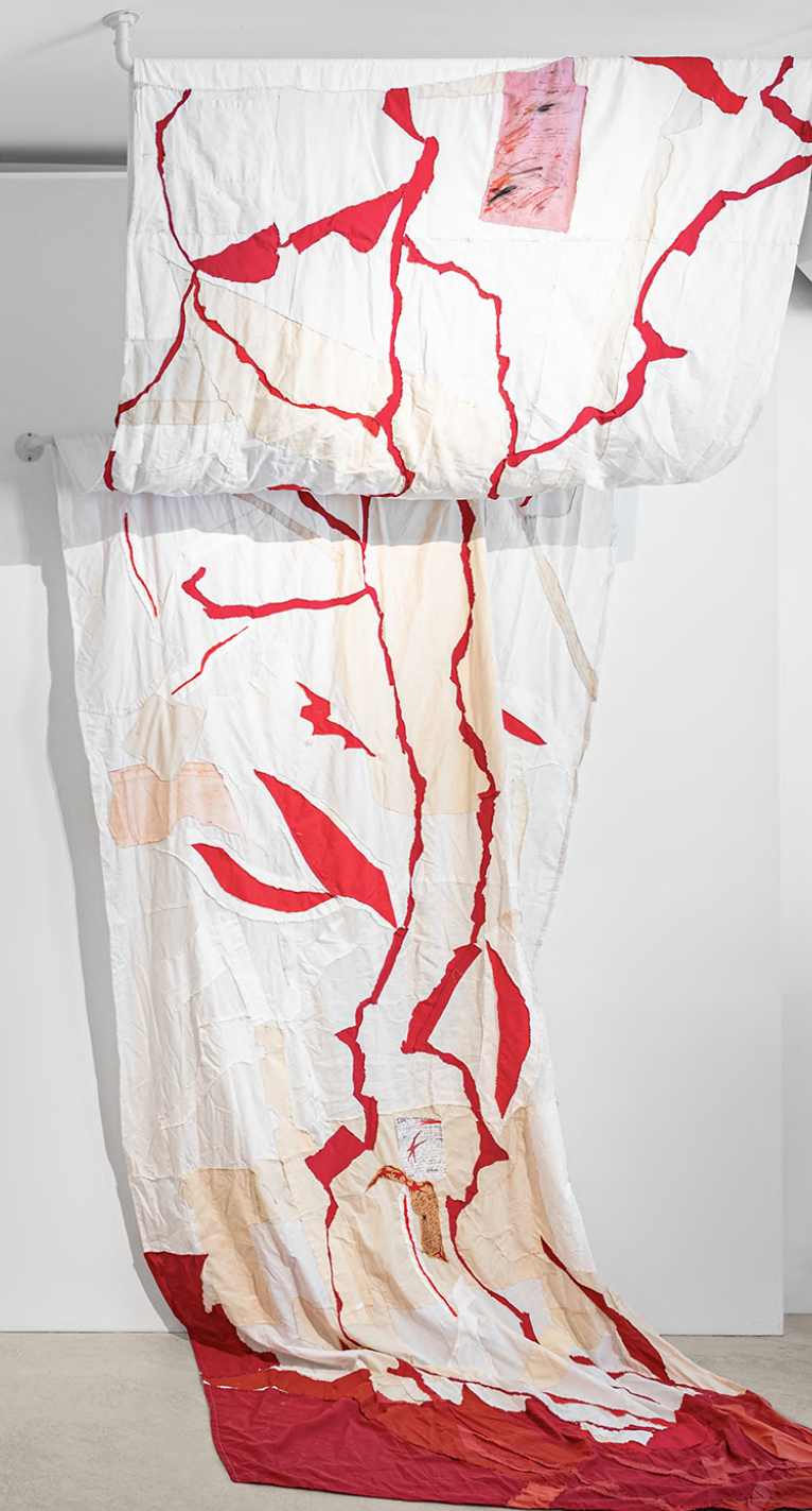
Memoir of a needle , various dimensions, hand-sewn recycled fabrics, Palo Gallery (New York), 2025