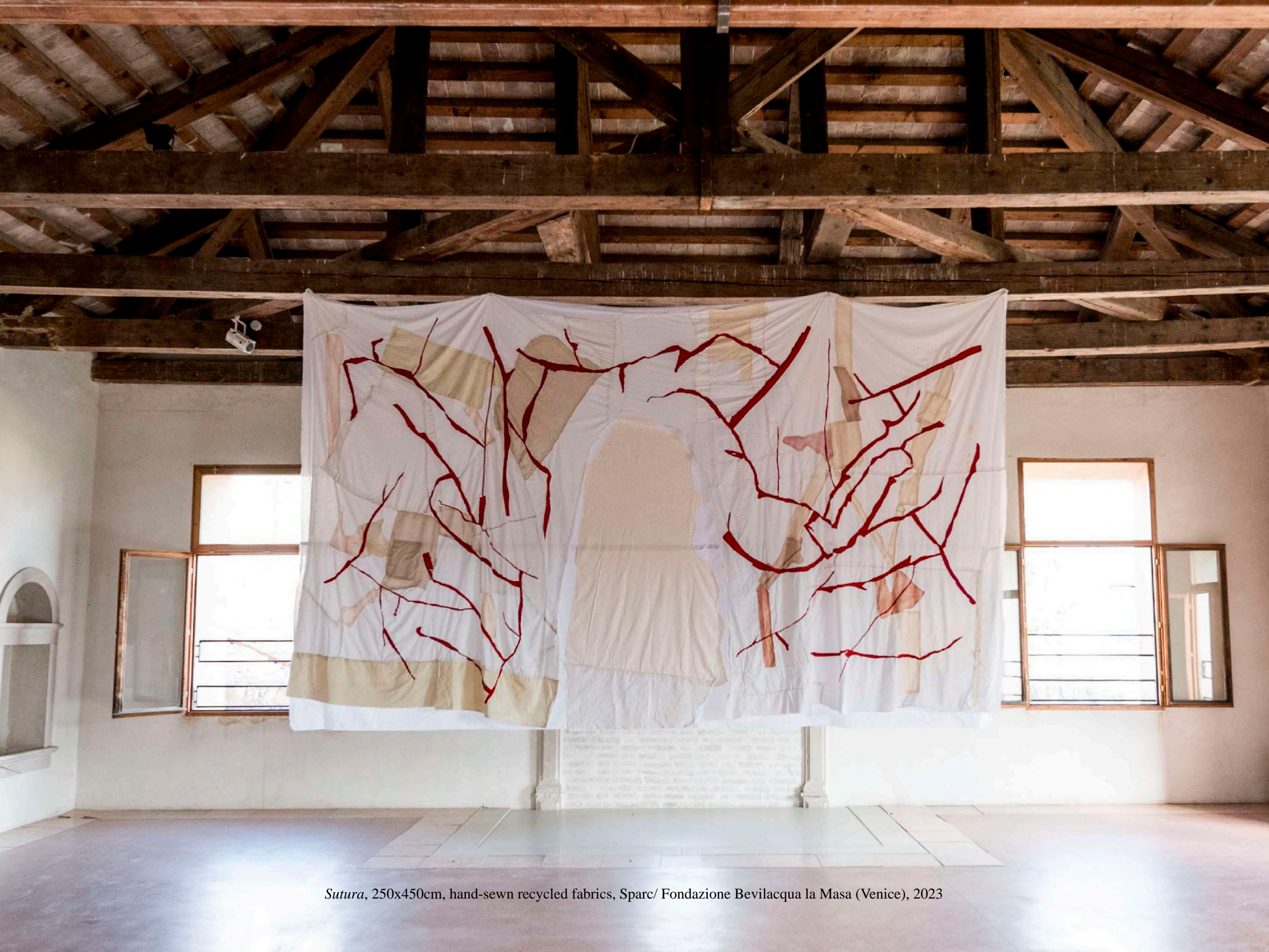
Sutura , 250x450cm, hand-sewn recycled fabrics, Sparc/ Fondazione Bevilacqua la Masa (Venice), 2023