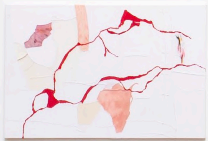
Sutura , 100x150cm, hand-sewn recycled fabrics, Palazzo Strozzi (Florence), 2021