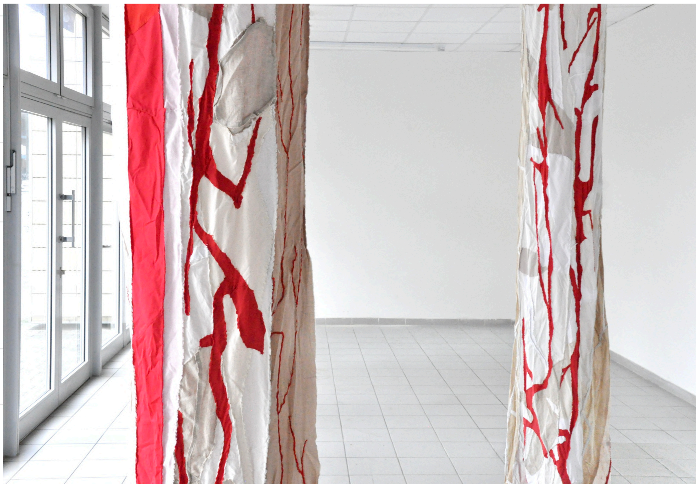
Sutura , 400x60cm, hand-sewn recycled fabrics, 2023