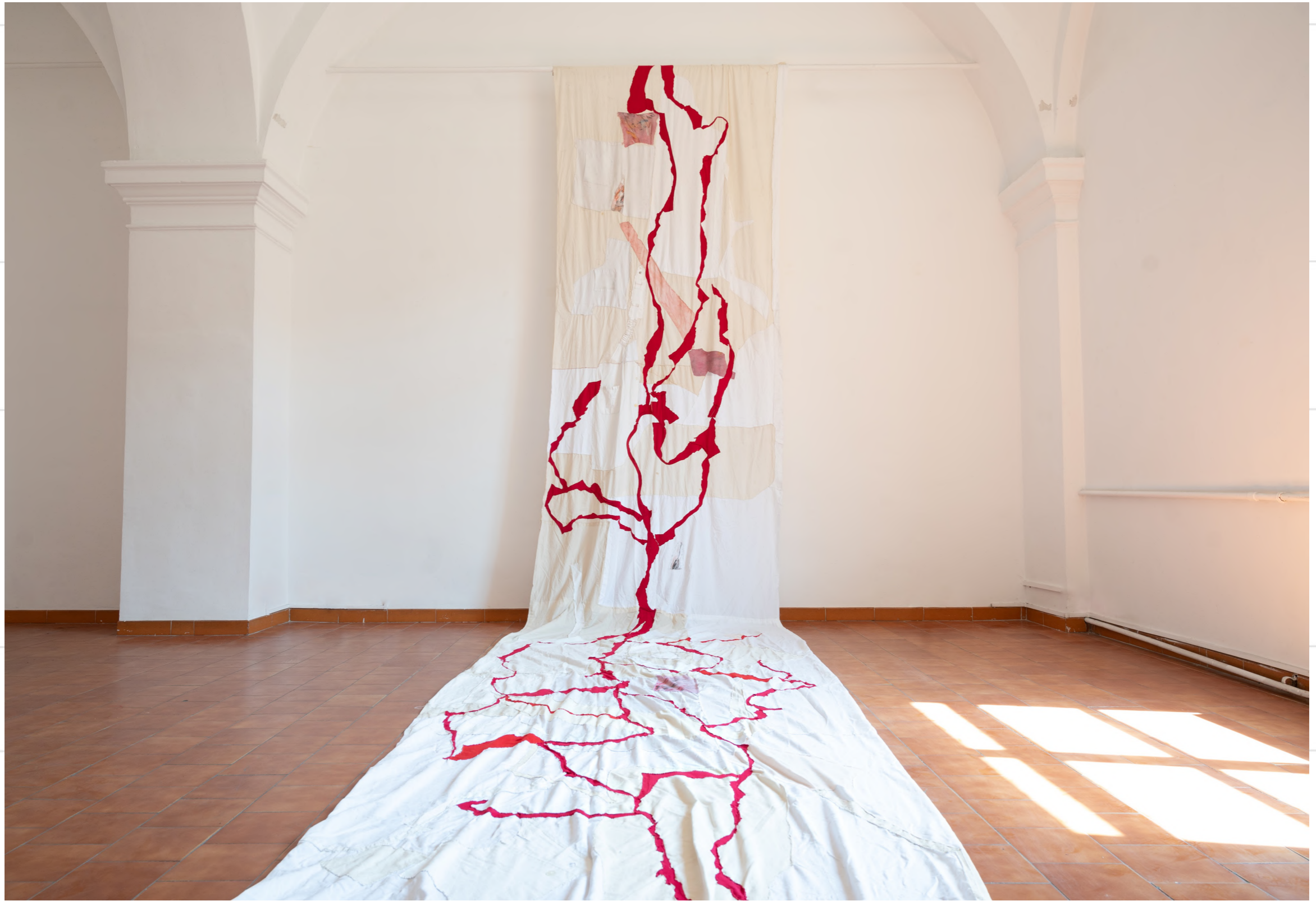
Sutura , 200x900cm, hand-sewn recycled fabrics, 2021-22