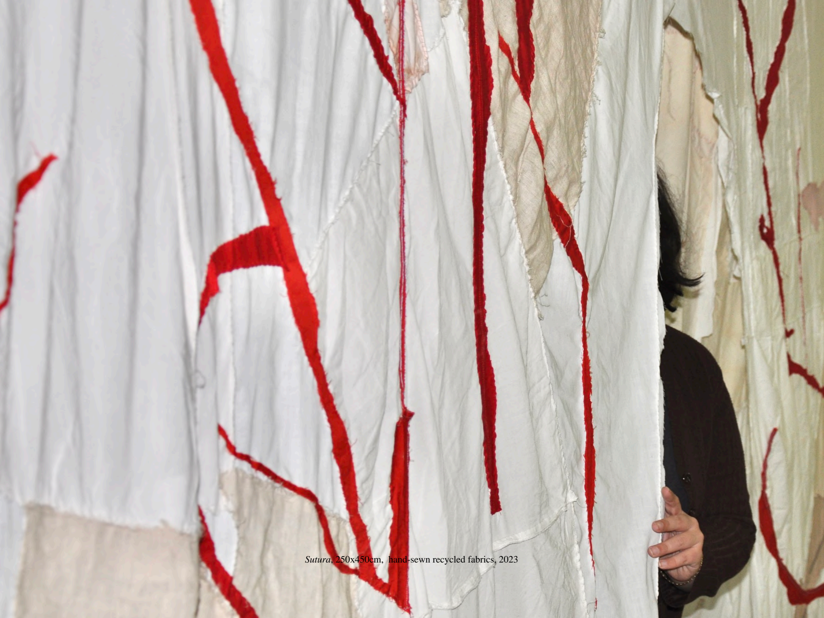
Sutura , 250x450cm, hand-sewn recycled fabrics, 2023