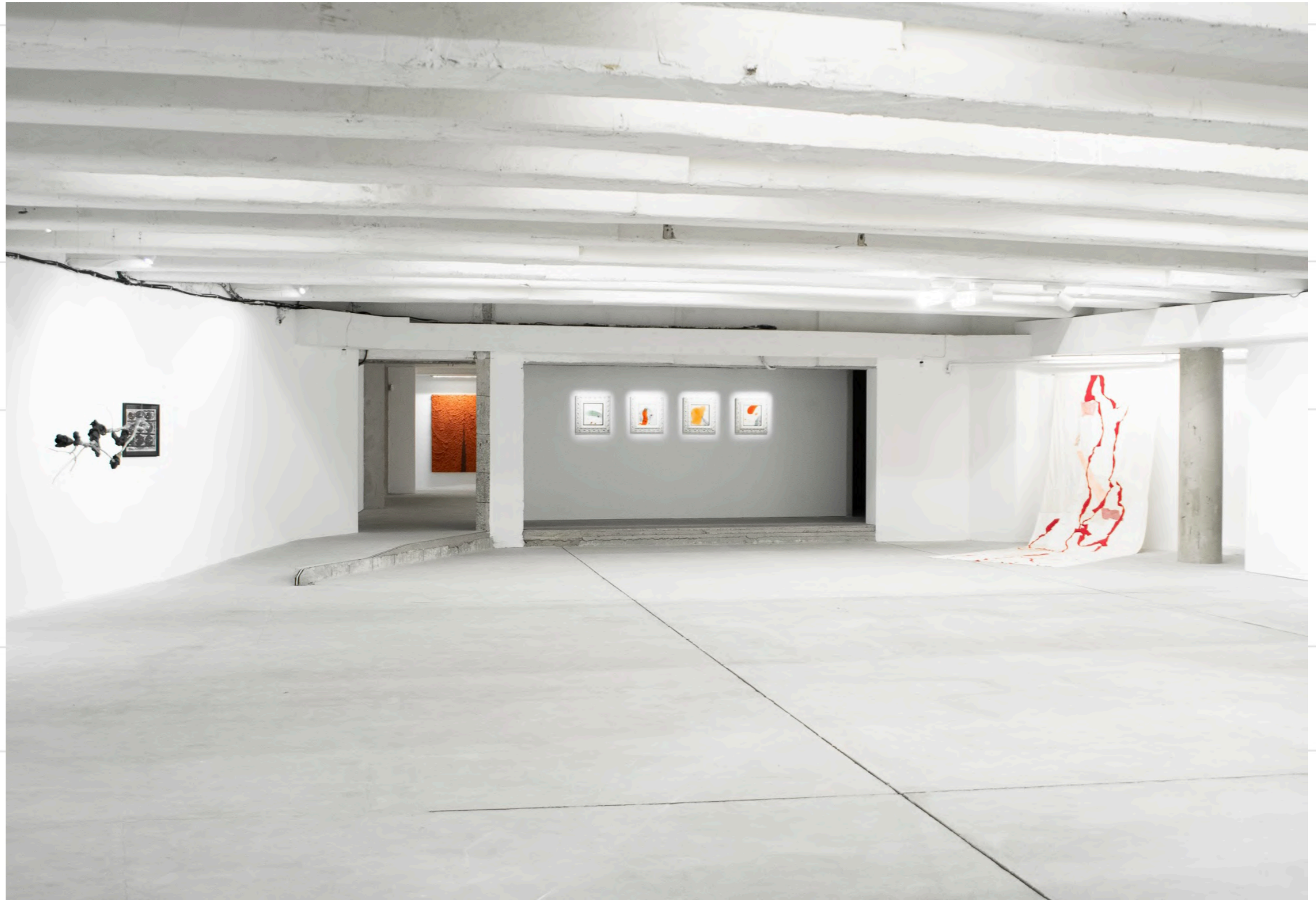
Sutura , 155x500cm, hand-sewn recycled fabrics, 2024