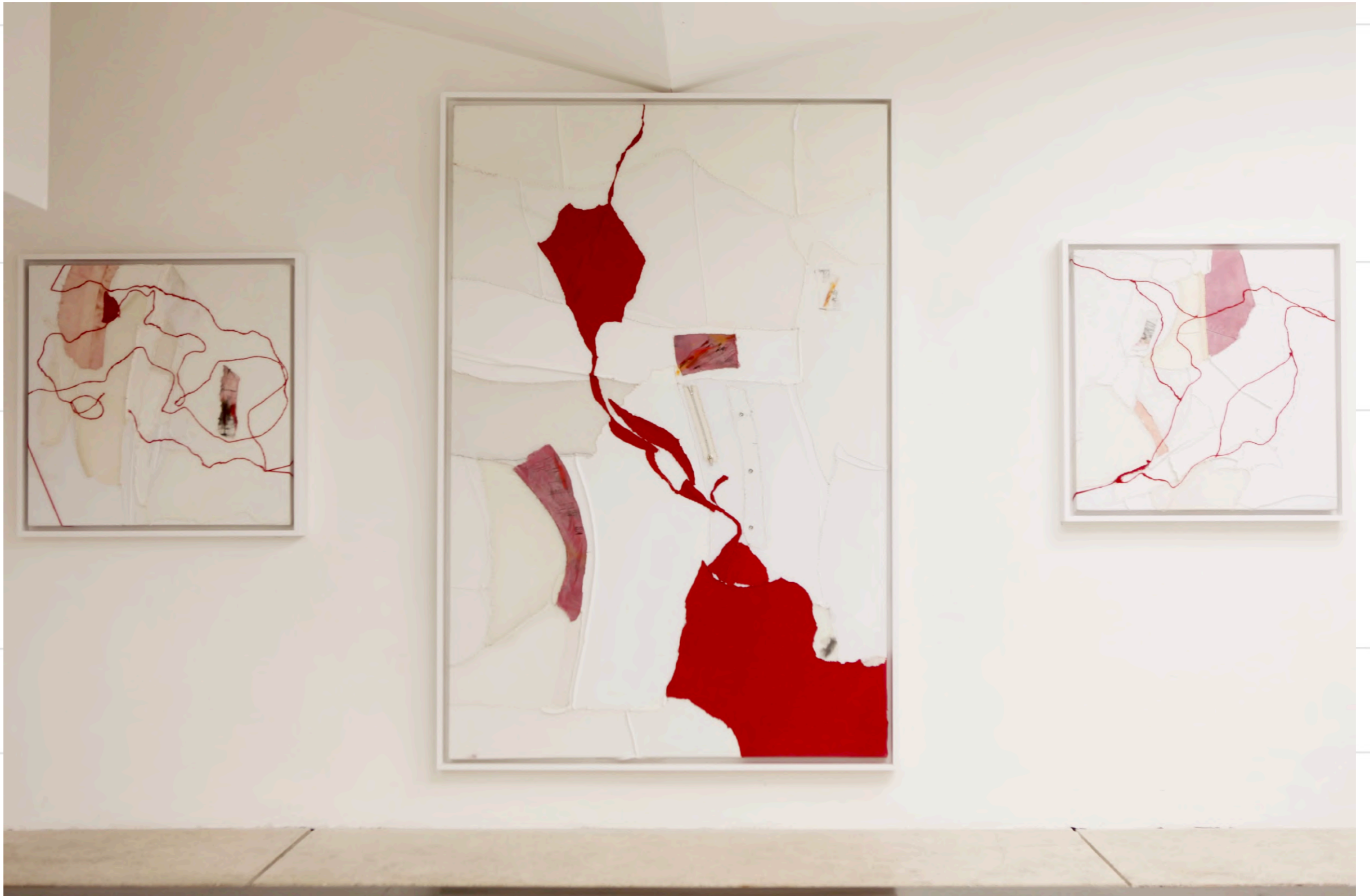
Sutura , various dimensions, hand-sewn recycled fabrics, 2022