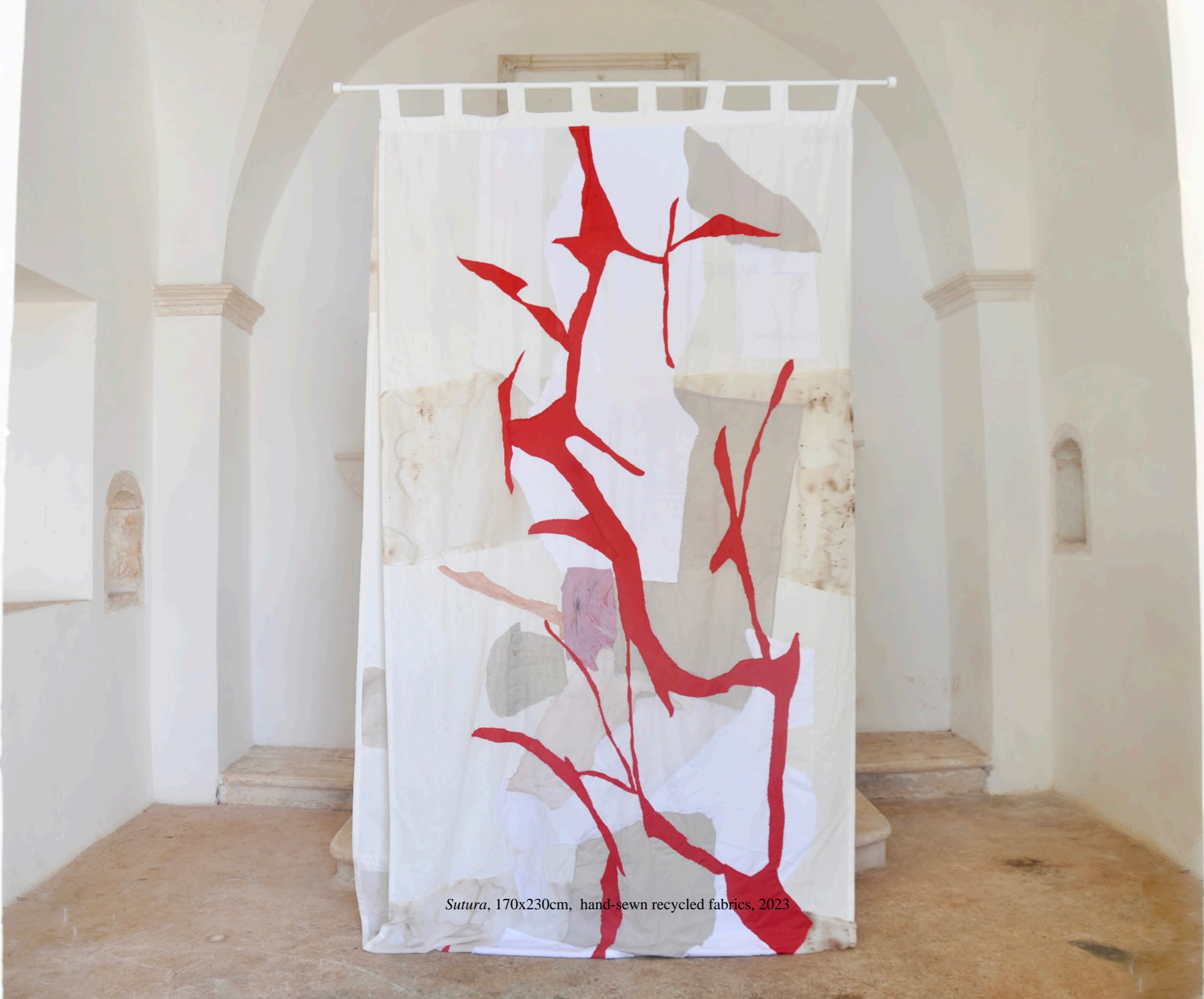
Sutura , 170x230cm, hand-sewn recycled fabrics, 2023