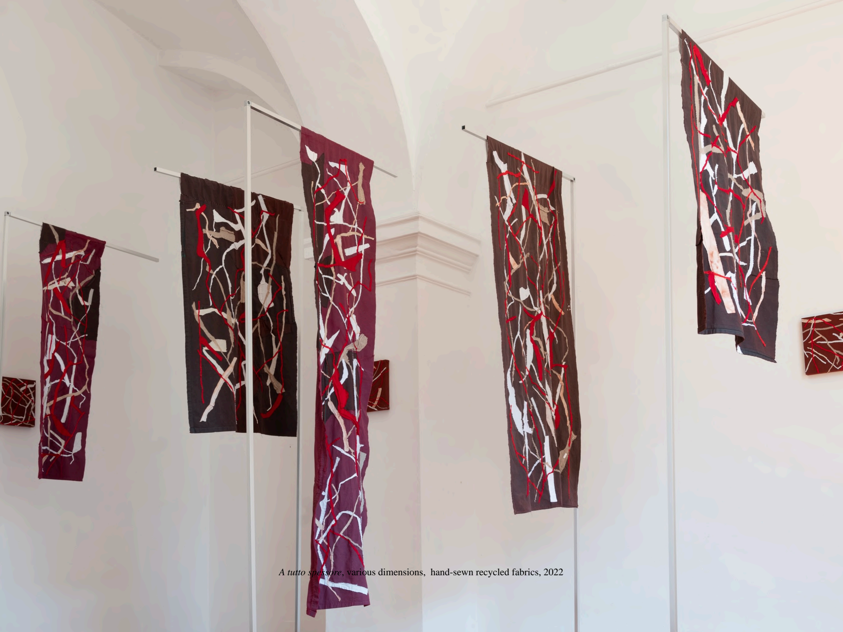
A tutto spessore , various dimensions, hand-sewn recycled fabrics, 2022