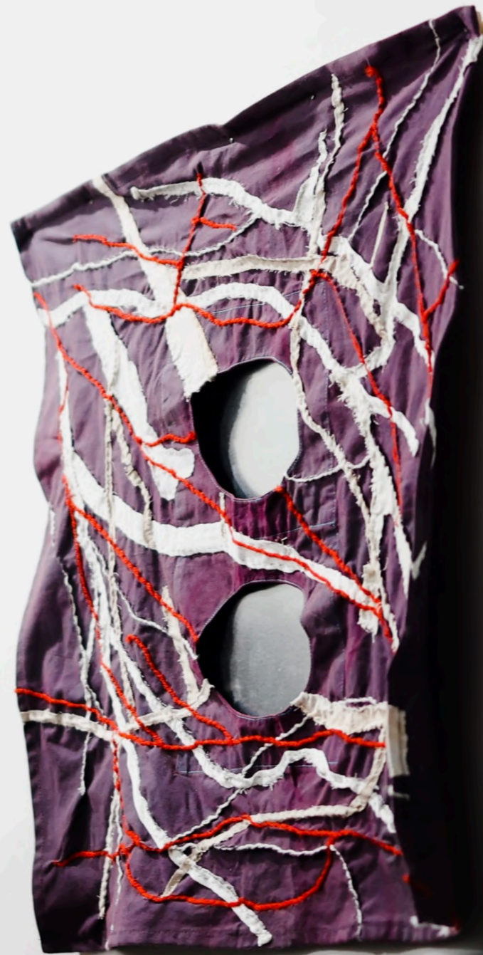
A tutto spessore , 60x60cm, hand-sewn recycled fabrics, 2023