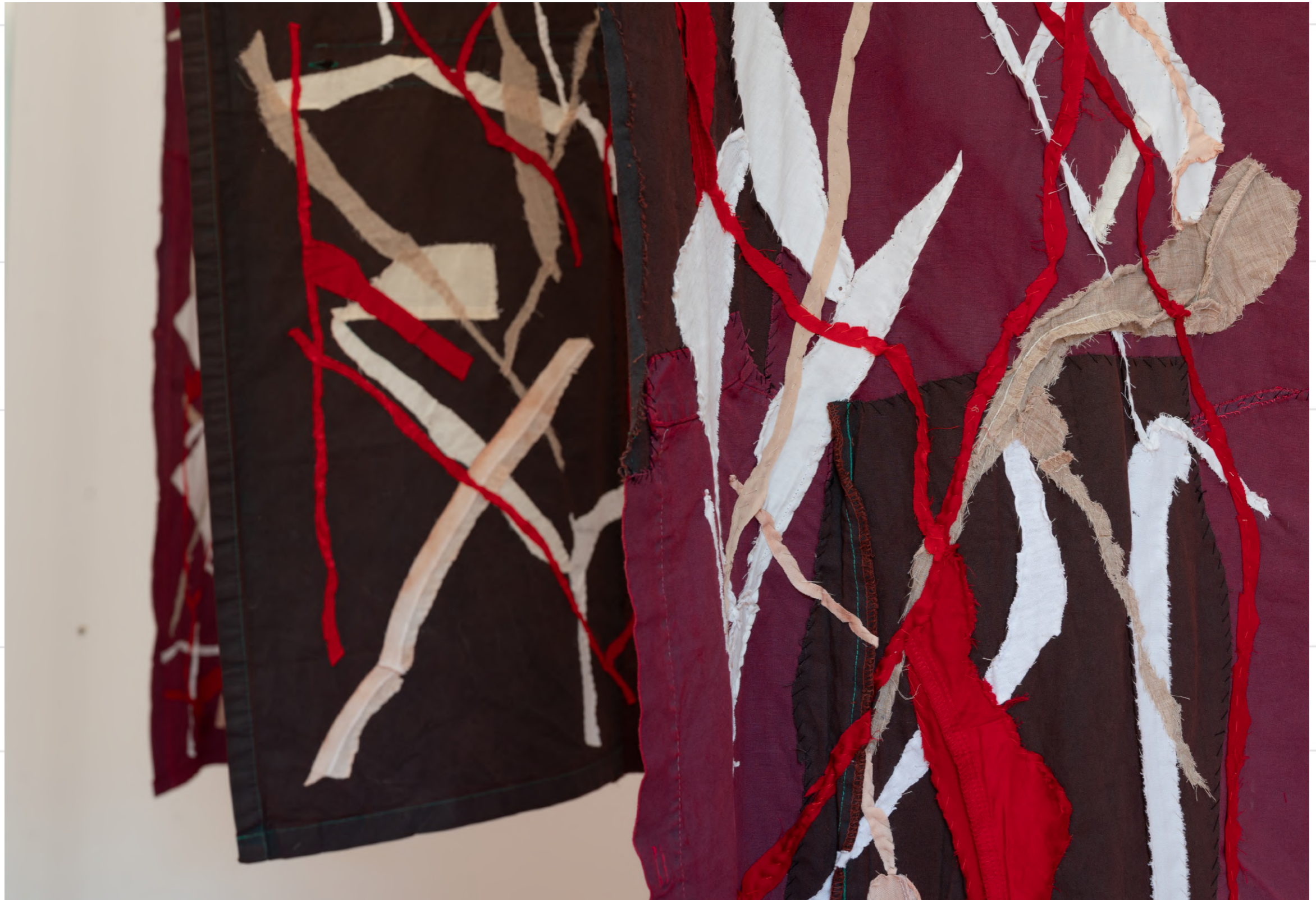
A tutto spessore , various dimensions, hand-sewn recycled fabrics, 2022