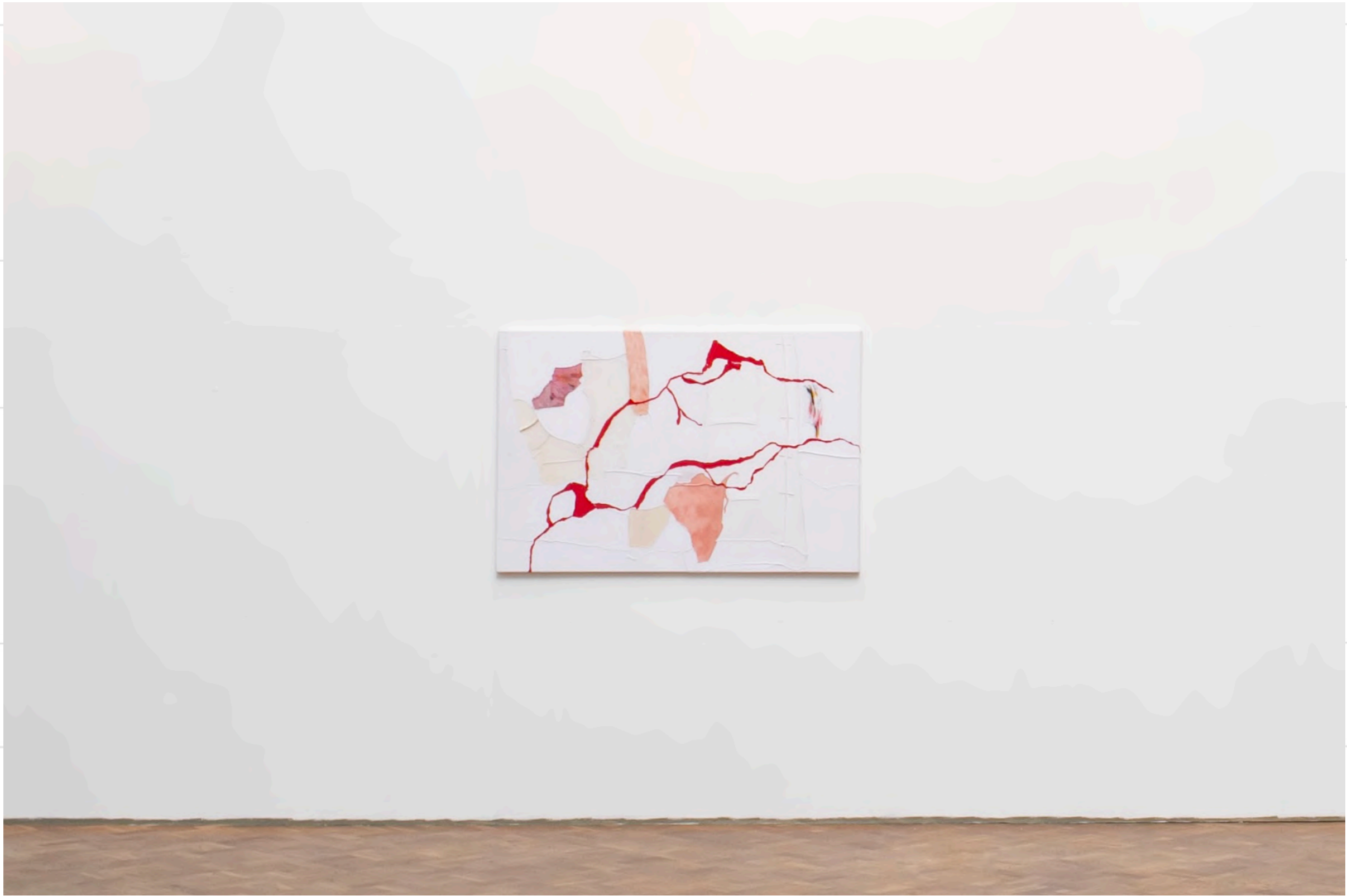
Sutura , 100x150cm, hand-sewn recycled fabrics, 2021