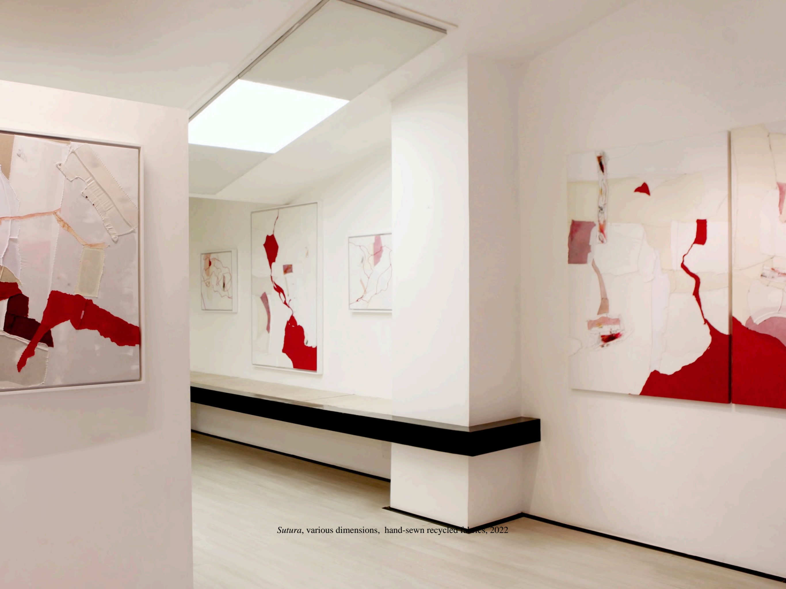
Sutura , various dimensions, hand-sewn recycled fabrics, 2022