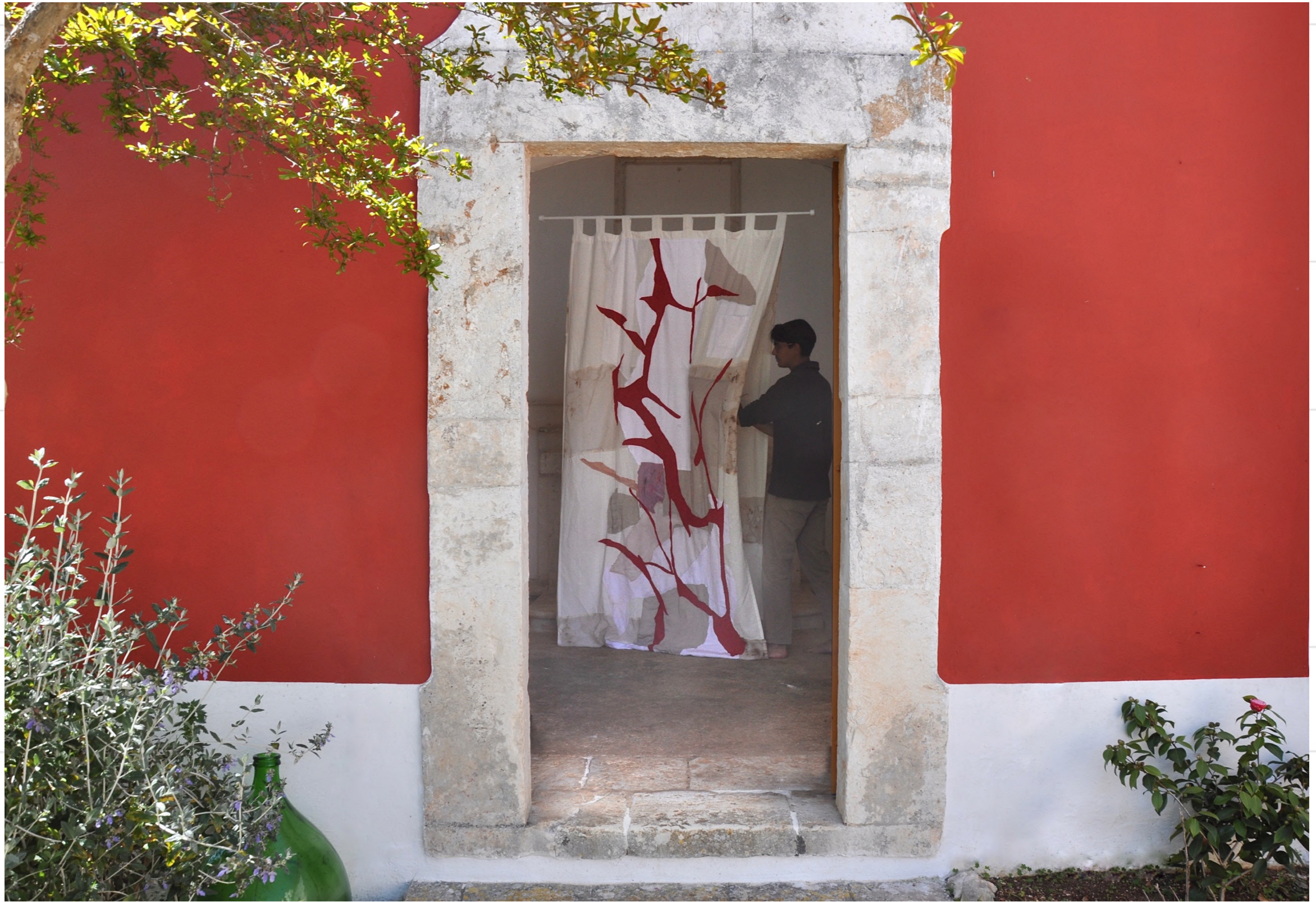
Sutura , 170x230cm, hand-sewn recycled fabrics, 2023