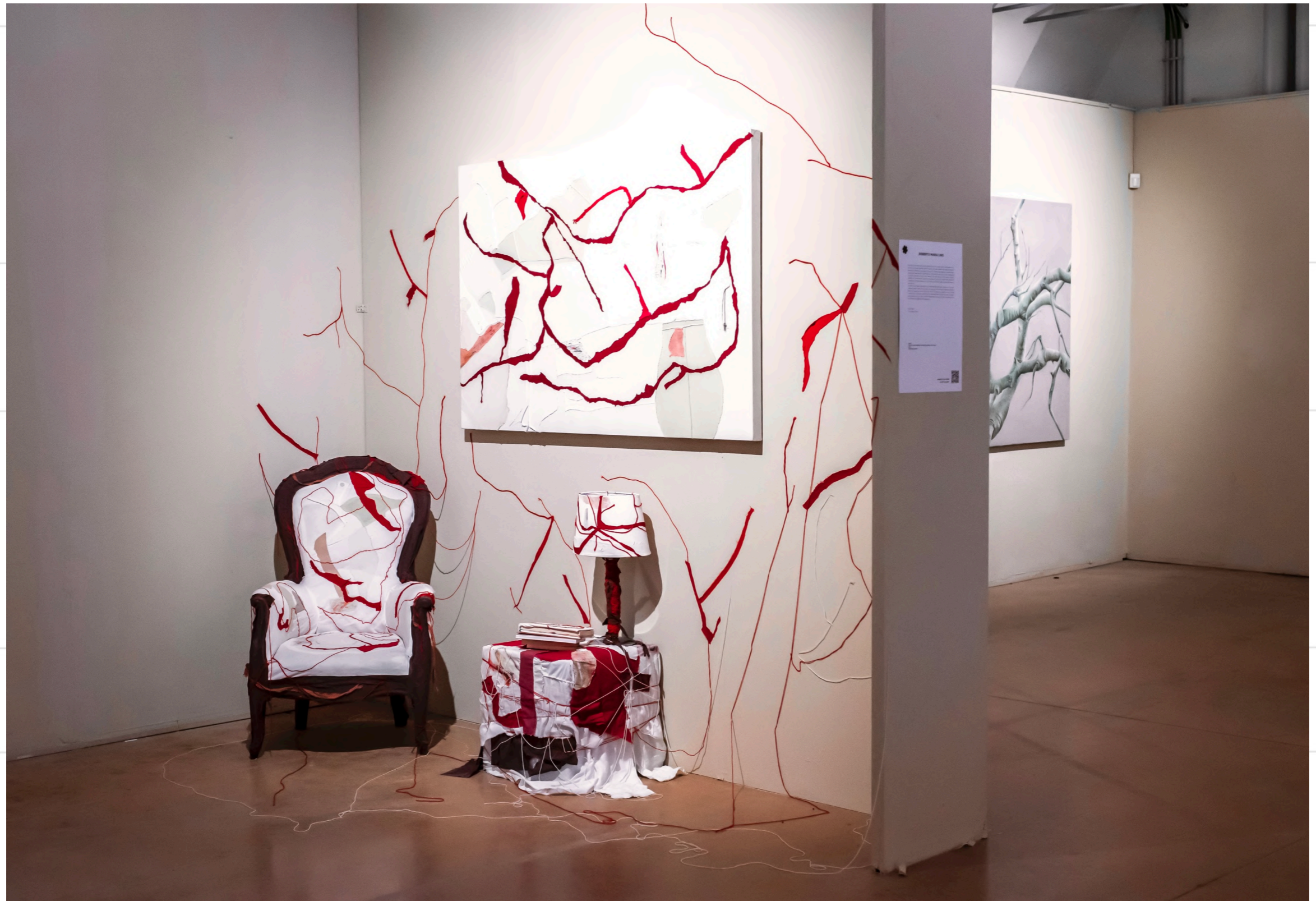
Sutura , various dimensions, hand-sewn recycled fabrics, 2022