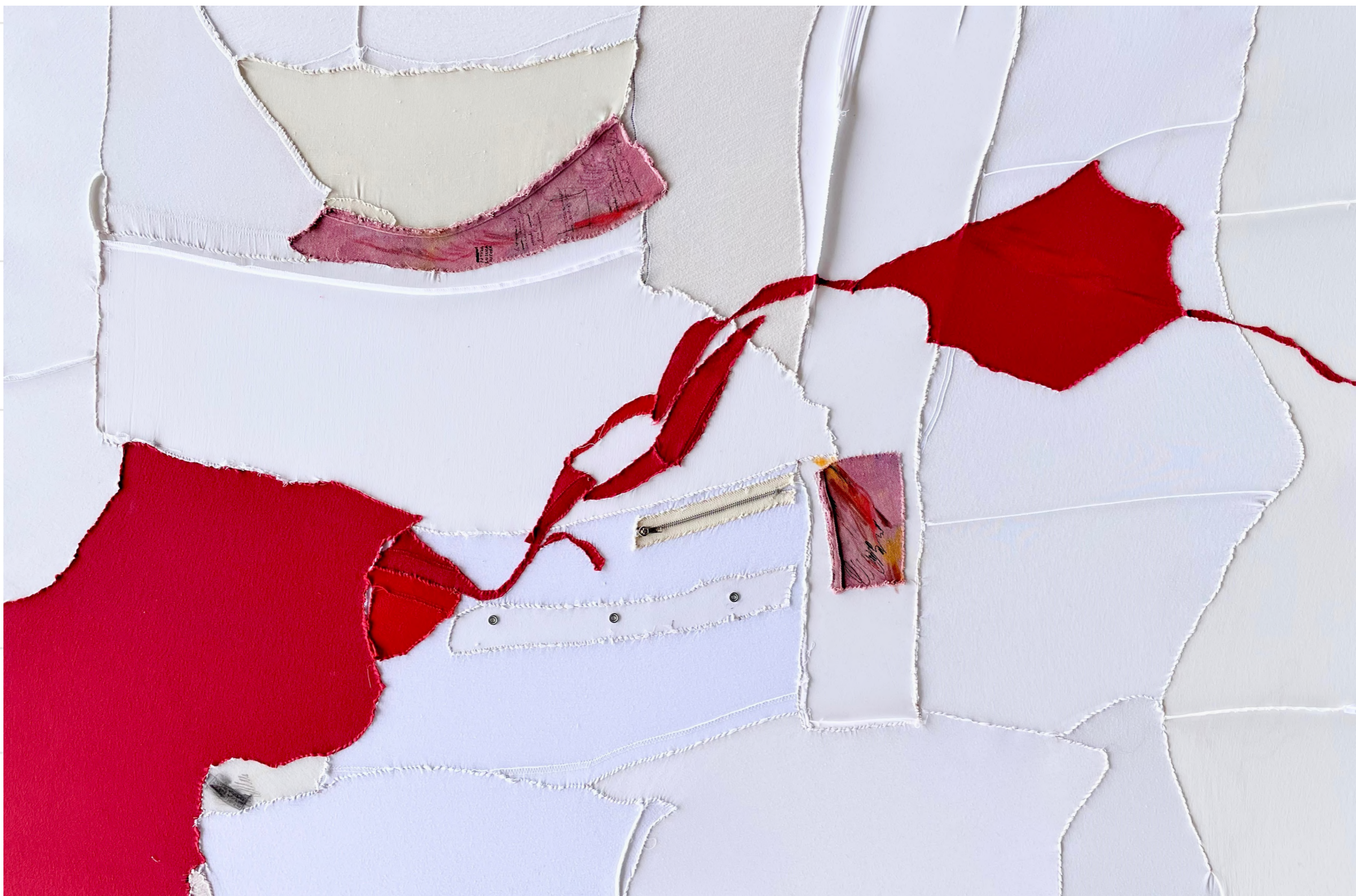
Sutura , 180x130cm, hand-sewn recycled fabrics, 2023