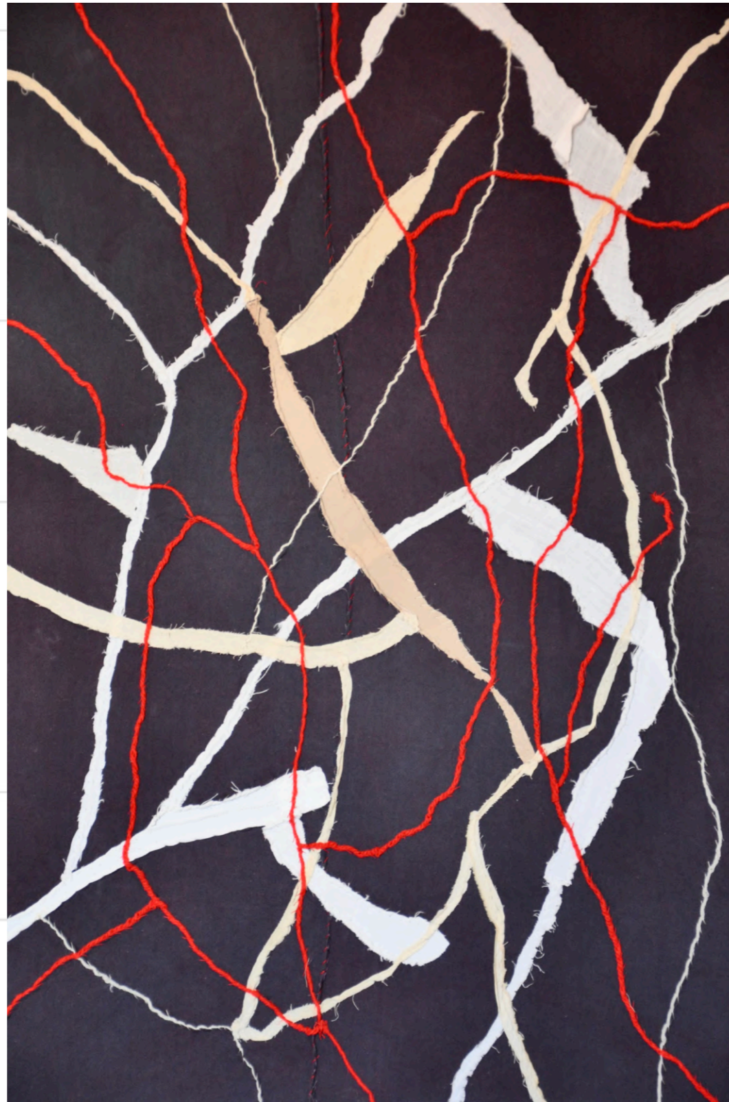
A tutto spessore , 70x100cm, hand-sewn recycled fabrics, 2022