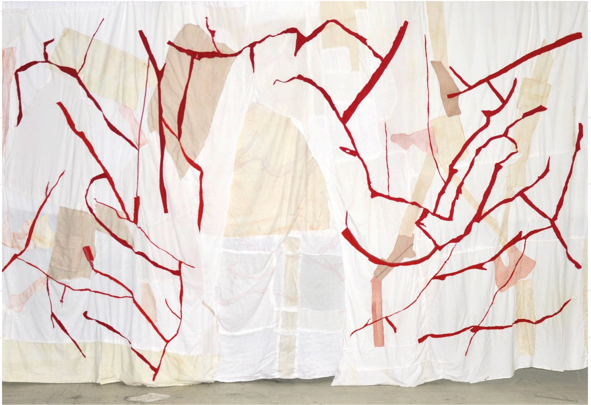
Sutura , 250x450cm, hand-sewn recycled fabrics, 2023