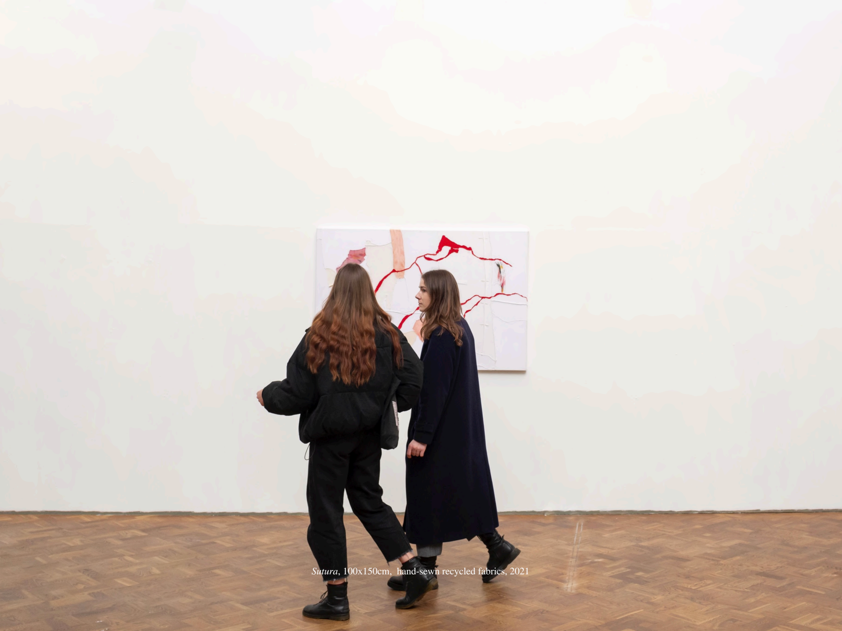
Sutura , 100x150cm, hand-sewn recycled fabrics, 2021