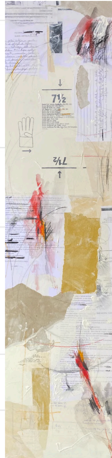
Registro Operatorio , 100x80cm, mixed technique, 2020