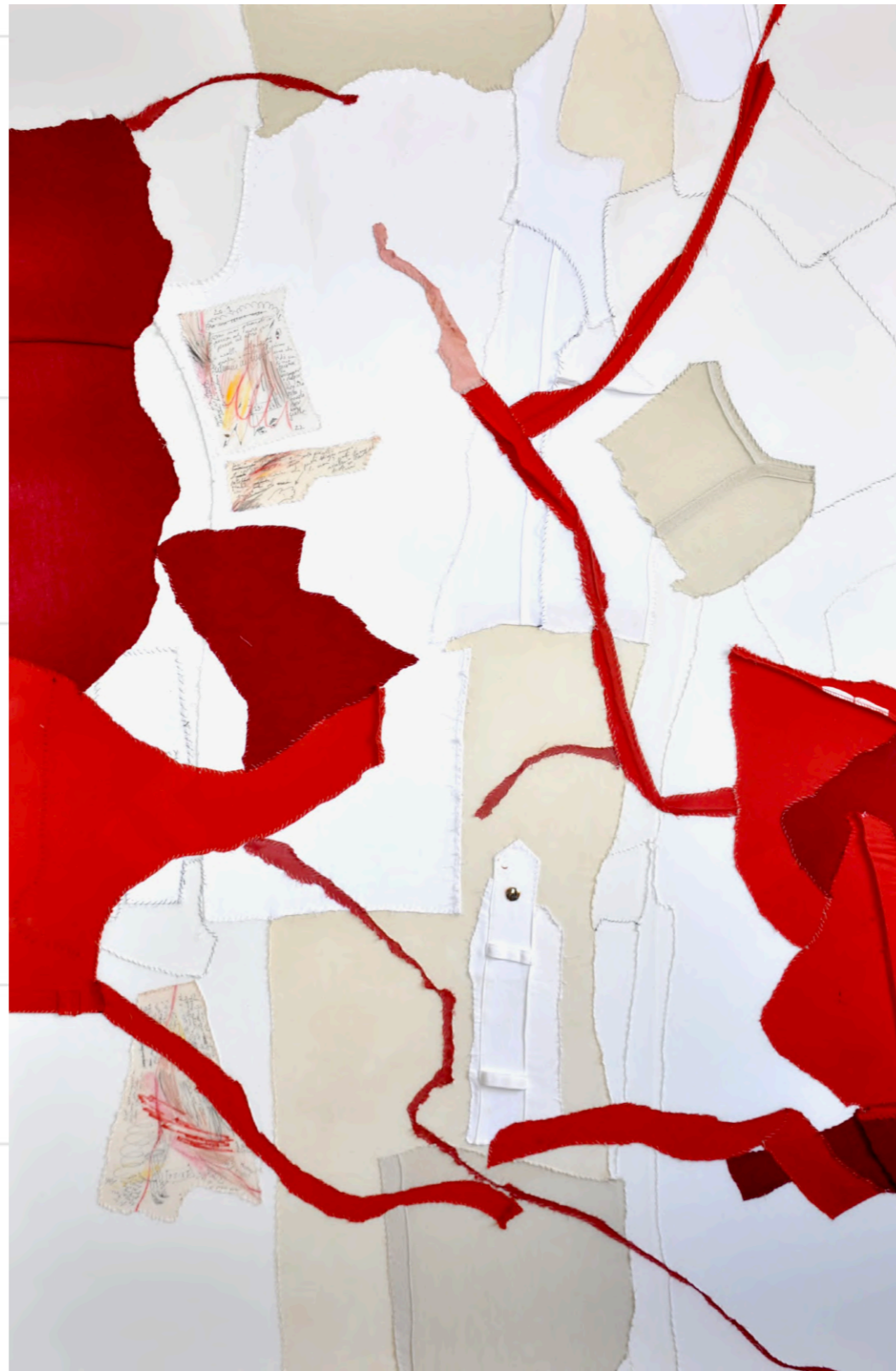
Sutura , 100x150cm, hand-sewn recycled fabrics, 2022