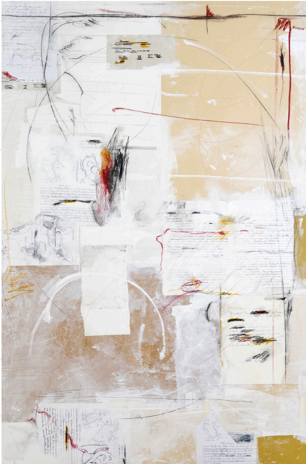
Registro Operatorio , 100x150cm, mixed technique, 2020